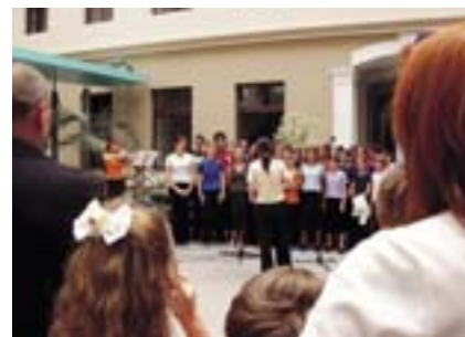
Children's ensemble Usmev is singing at opening of the Danube Day at Slovak Ministry of the Environment.

GWP Slovakia organized a clean up of the Danube riverbank where art school students celebrated Danube Day by drawing and playing musical instruments. The singing ensemble Usmev contributed to the official program held in the Ministry of the Environment atrium in the heart of Bratislava. GWP Slovakia encouraged schools from all around