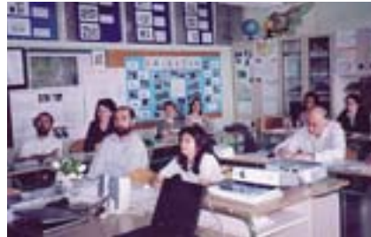
GWP Slovenia organised seminar for teachers in Rodica, Slovenia

ce linked with the country's hydro-geological conditions, its importance from the point of view of drinking water supply, the observation network, the quantitative and qualitative characteristics and their implications for the operation of the observation network. A discussion