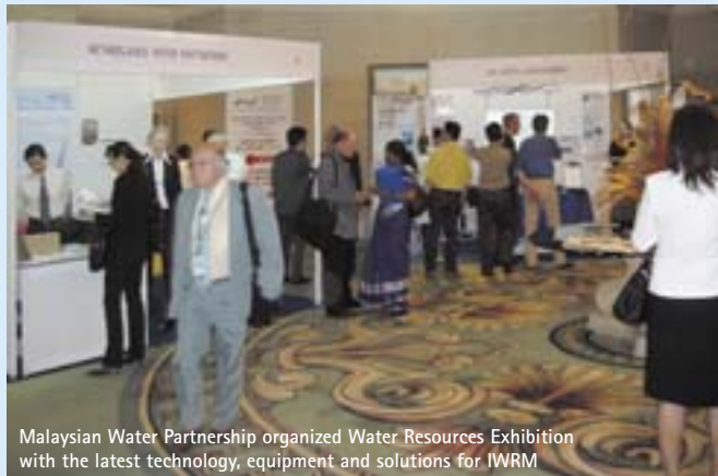
Malaysian Water Partnership organized Water Resources Exhibition with the latest technology, equipment and solutions for IWRM

THE ANNUAL GWP CONSULTING PARTNERS MEETING WAS ORGANIZED IN KUALA LUMPUR, MALAYSIA ON JUNE 11-12, 2004 in conjunction with the 1st Malaysian Water Week, an event organized by the Malaysian Water Partnership (MyWP). The integration of these events enabled the participants from Malaysia to interact with a broad range of stakeholders from other parts of the world and vice-versa. Through this forum both audiences shared valuable experience and knowledge on common problems.