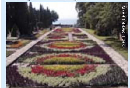
Botanical garden in Balchik, Bulgaria

GWP-BULGARIA SUPPORTED THE PROPOSAL OF MRS DOLORES ARSENOVA, THE MINISTER OF ENVIRONMENT AND WATER, to change the status of the Botanical Garden in the town of Balchik. The establishment of a protected area will save many plant species and improve the quality of the water in this tourist area. Many GWP partners are members of the Public Committee for Saving the Balchik Botanical Garden. ■