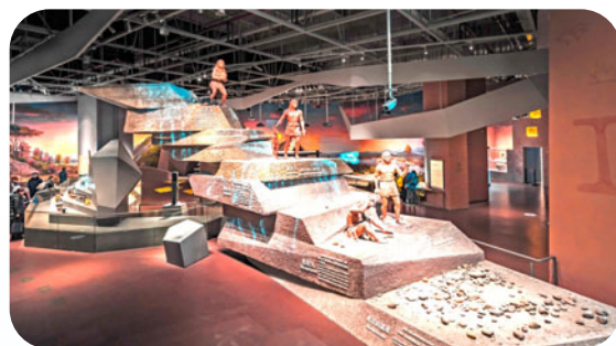
The Changjiang Civilization Museum

Note: Technical visits will be further improved and expanded.