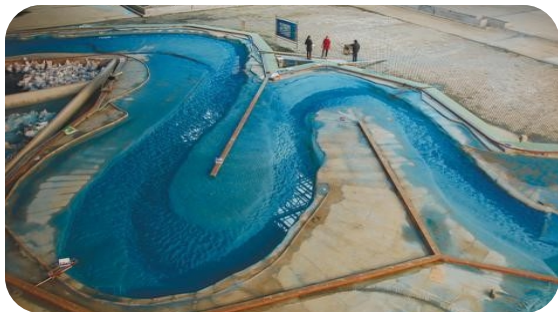
The Yangtze River Flood Protection Physical Model