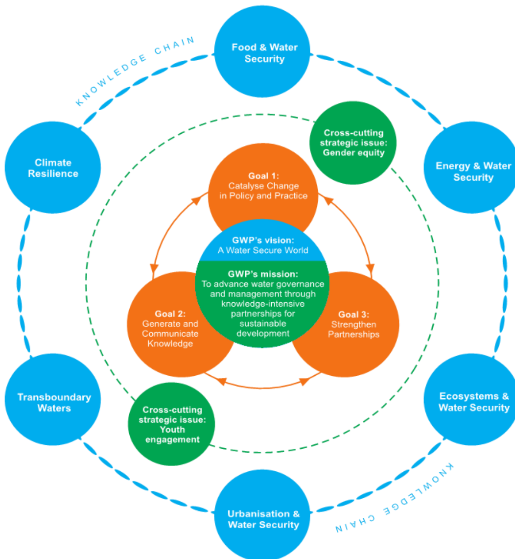
Figure: GWP Strategy – Towards 2020

The GWP Strategy for the period 2014 to 2019 has been developed on the basis of a theory of change with a new mission and three well-defined goals developed in consultation with stakeholders across the GWP Network. The Strategy is summarised in the diagram following.