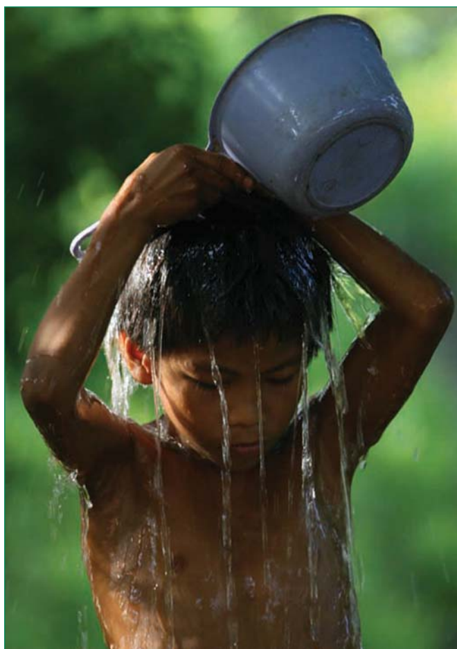
Water is essential

Negotiators in Copenhagen face competing priorities. Actions to mitigate and adapt to climate change in one sector must not undermine those in another. For example, developing hydropower as a low-carbon energy source should be done in socially and environmentally responsible ways; using scarce land and water resources to produce bio-fuels should be balanced against other uses such as food production.