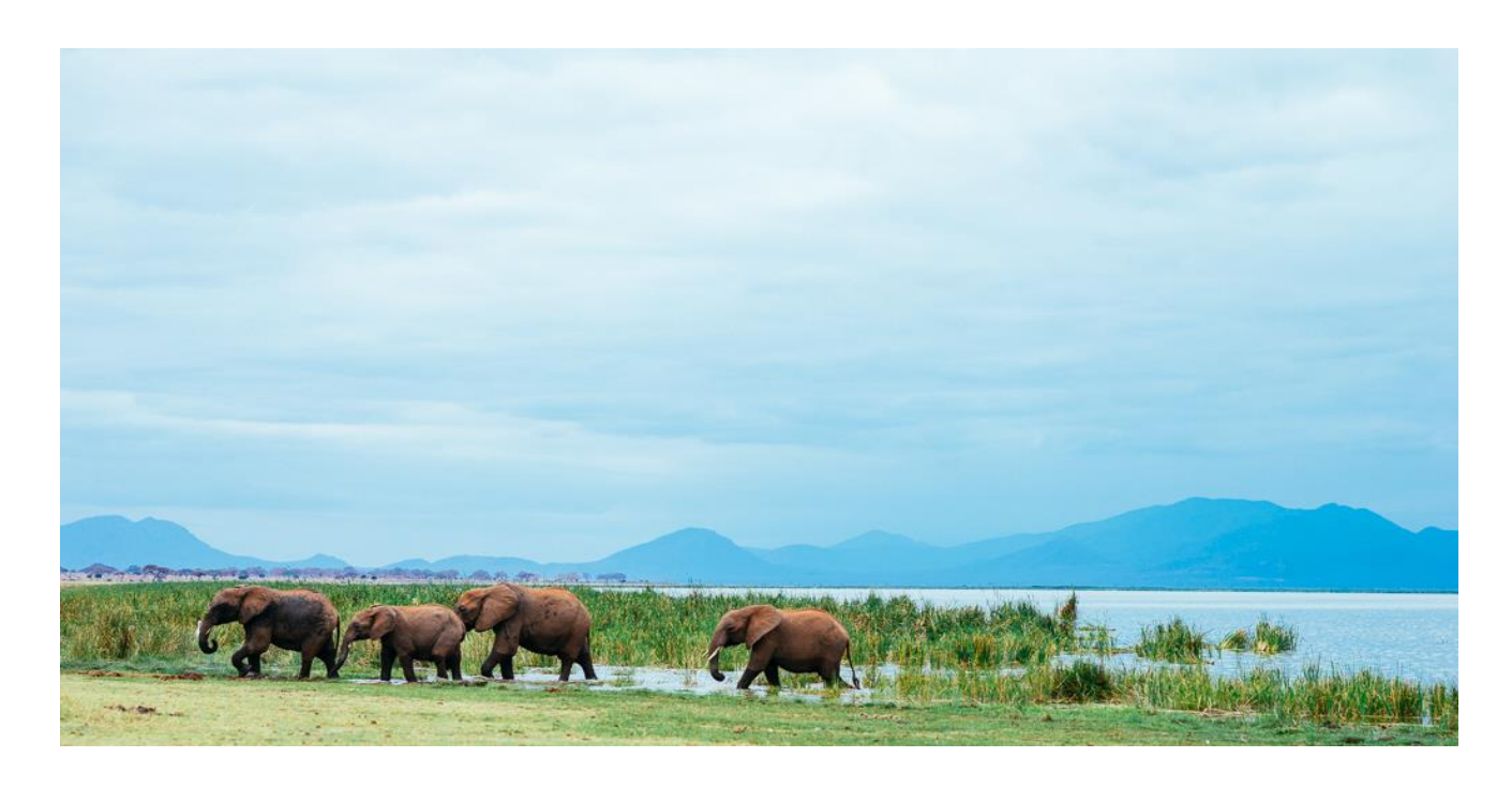
Kenya: The challenges facing the implementation of IWRM in Lake Jipe Watershed