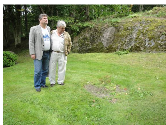
Conversation with Patron of GWP - Visit to the Bjorn's grave in Trossa

During reporting period GWP CACENA has undertaken a wide information activity on GWP in all countries over the region (www.gwp-cacena.org).