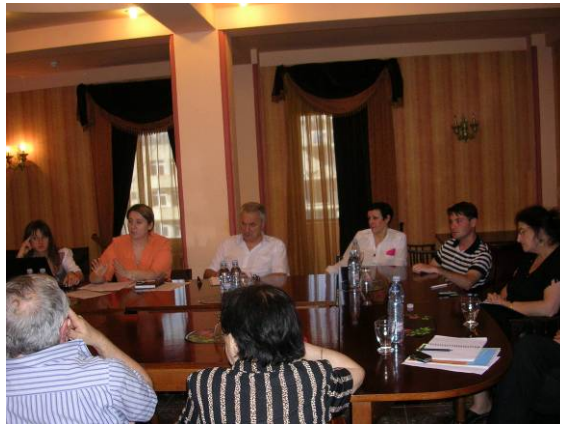
Presentation of the documents in the Round-table discussion leaded by CWP-Ministry of Environment supported by CWP Georgia