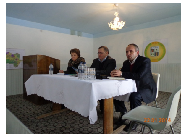
Presentation of the technical working design

2.4. The stakeholder meeting on the demonstration project within WACDEP CACENA was held on 22 January 2014 in the Parakar village in Armenia. The technical working design of wastewater treatment units in the Parakar village (second stage) was presented and discussed. Representatives of local authorities, engineers and local residents participated in the meeting. Participants approved the technical working design presented. Impact of construction and operation of wastewater treatment units on environment and human health was assessed. As well the Environment Management Plan was developed. The technical working design was submitted for technical expertise. Currently the documentation is being prepared to organize a tender on construction of wastewater treatment units in the Parakar village.