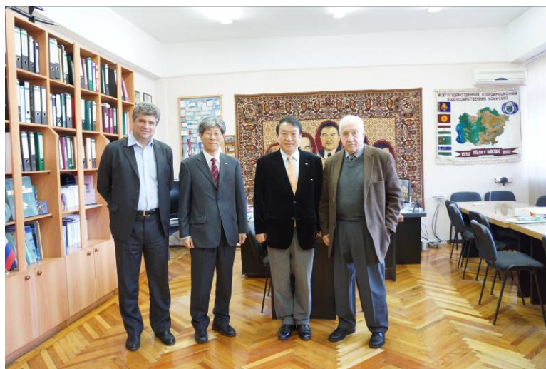
Delegation of KICT in the office of SIC ICWC (Prof. Dukhovny) in Tashkent, 19 December 2013