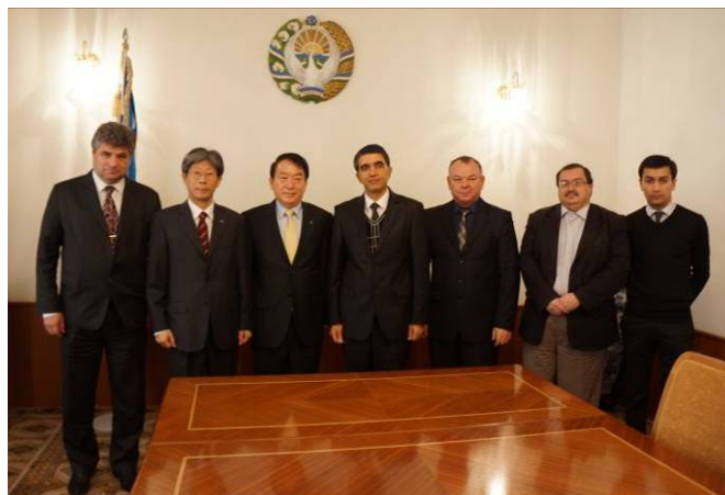
Delegation of KICT with Staff of the Ministry of Agriculture and Water Resources of the Republic of Uzbekistan in Tashkent, on 20 December 2013