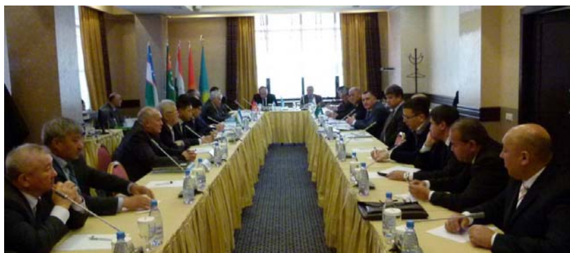
62 nd meeting of the Interstate Commission for Water Coordination, 18 December 2013 Almaty, Kazakhstan