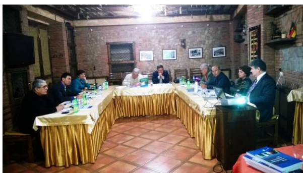
GWP CACENA Regional Council meeting, Tbilisi, December 2013