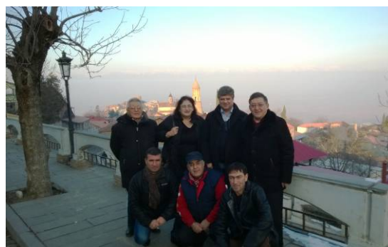
Meeting participants on an excursion to Signaghi museum town in Kakheti (UNESCO World Heritage)

1.11. In December 2013 CWP-Kazakhstan conducted negotiations with the public association "Syr-Myraby" and the Kazakh research institute named Jakhaev I. on implementation of demonstration project "Water regime control, irrigation water 13 saving and efficient use in the pilot plot under