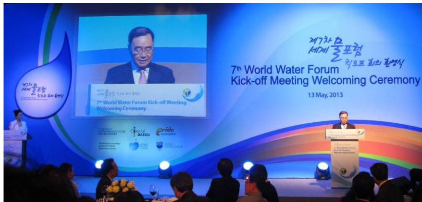
Mr. Hongwon Chung, Prime Minister of the Republic of Korea welcoming participants of the 7 th World Water Forum Kick-off Meeting in Seoul, May 2013

the water suffering" - the World Water Council President Ben Braga said by opening the Kick-off Meeting.