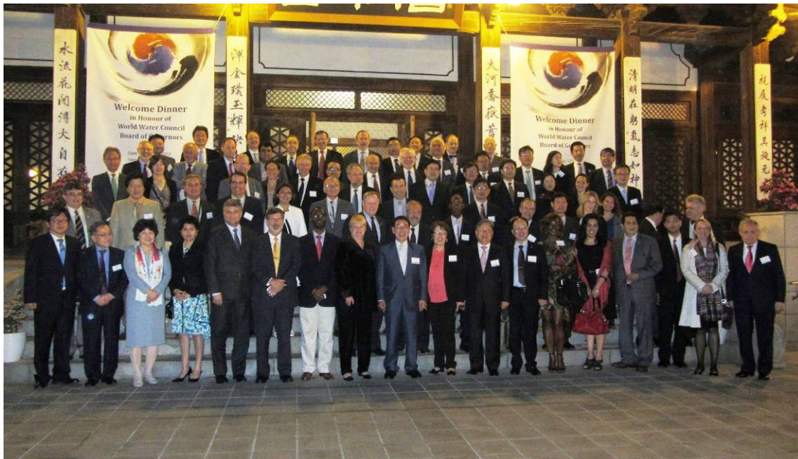
Participants of the WWC 49th BoG in Korea, May 2013

The next Board meeting is planned to be held in October jointly with the Budapest Water Summit.