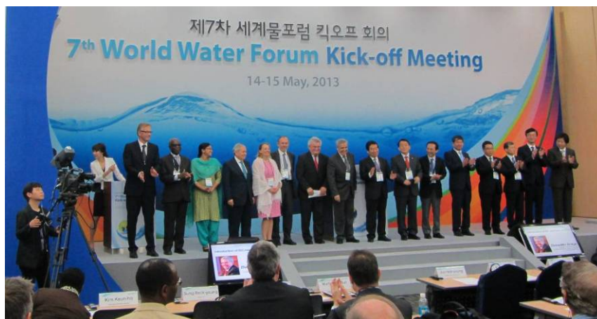
First introduction of the International Steering Committee Members of the 7 th World Water Forum to the participants of the Kick-off Meeting in Daegu, May 2013