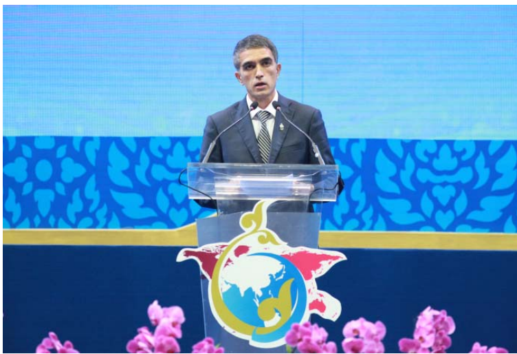
Mr. Shavkat Hamraev, Deputy Minister of Agriculture and Water Resources of Uzbekistan