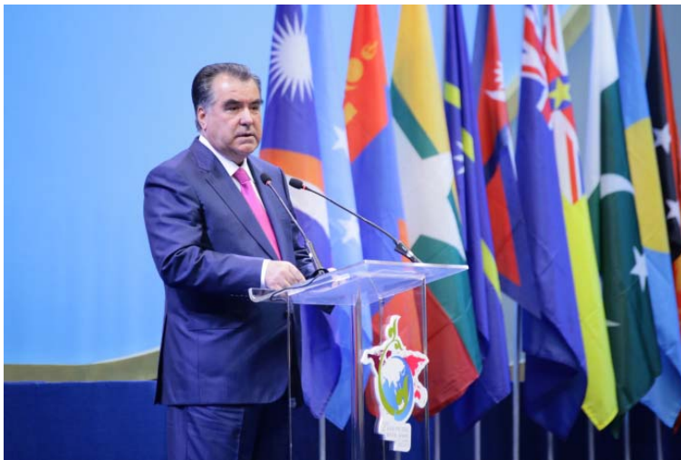
H.E. Mr. Emomali Rahmon, President of the Republic of Tajikistan