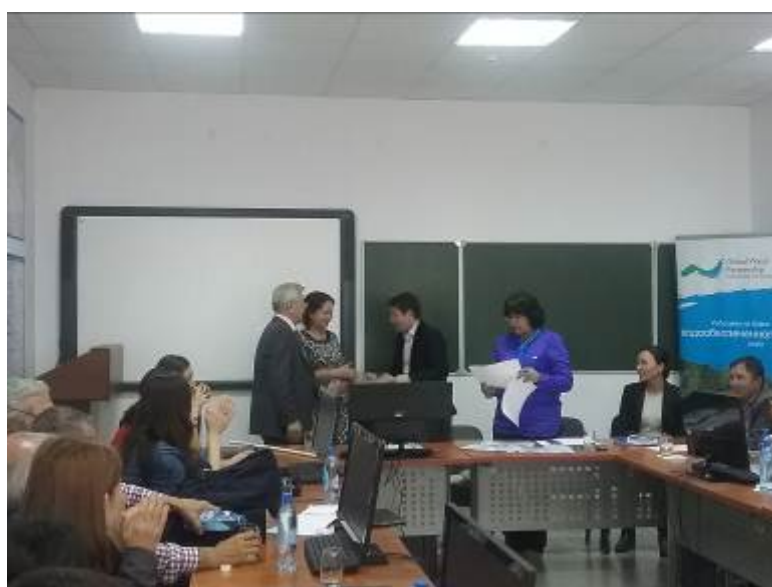
Presentation of certificates