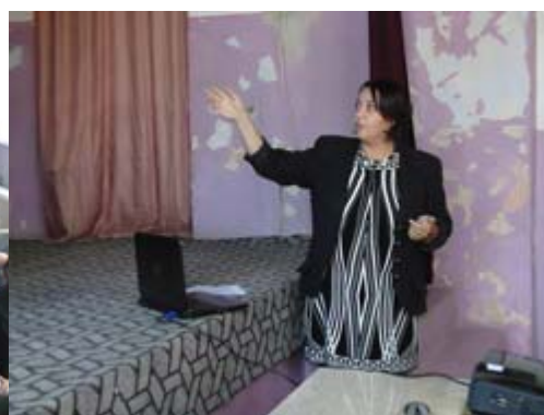
Training-seminar on 16 October 2015