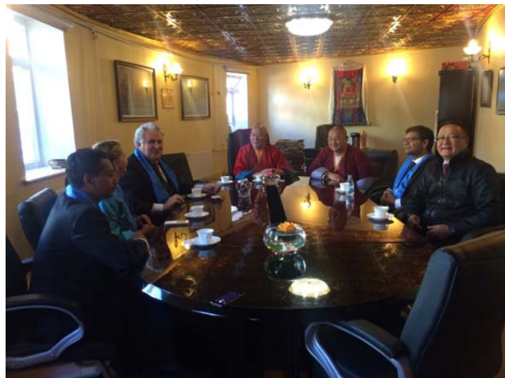
Meeting with Buddha lama

GWP representatives expressed interest to develop water culture in Mongolia and to support Mongolia in keeping culture regarding water protection and saving.