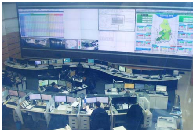
Participants of the AWC meeting at the Central Dispatch Centre of the National Water Management System of Korea, located in the K-Water Headquarter in Daejeon.