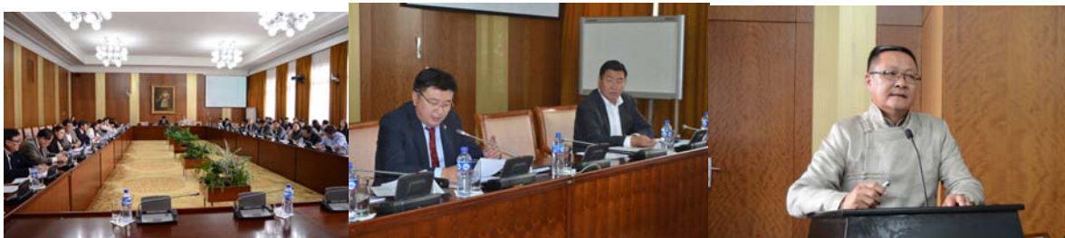
Discussion in the Parliament of Mongolia

About 60 participants discussed and presented their suggestions on improvement of water sector including water legislation of Mongolia.