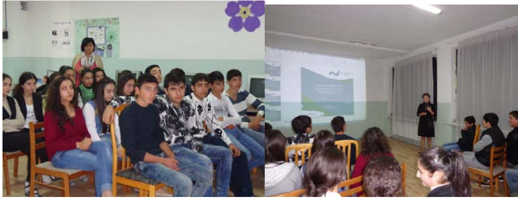
Training-seminar on 21 October 2015