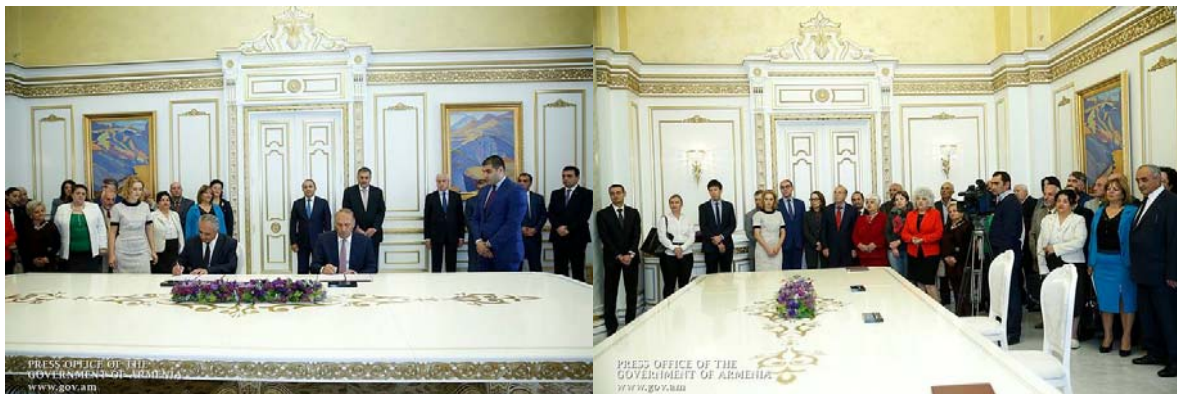
Signing the agreement