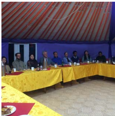
Opening ceremony of training course

The aim was to develop partnership, improvement a capacity of 26 water professionals on IUWM approach implementation.