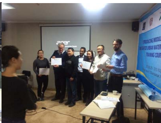
Presenting certificates of training course on IUWM to participants