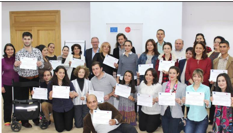
CWP-Armenia representatives received certificates

The training was held in Agveran. NGOs will have possibility to submit a project proposal within that program and 25 projects will be selected for financing (50 thousand euro/ per project).