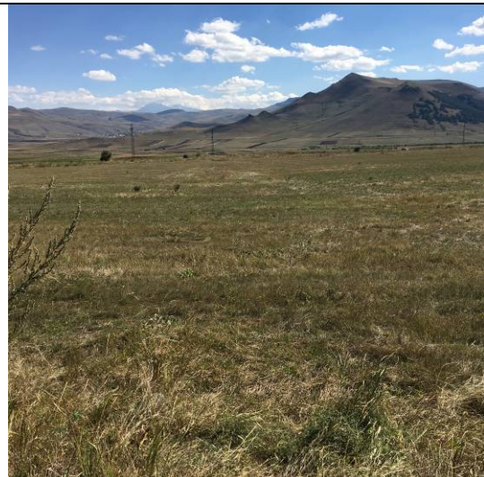
Degraded land in the Metz Parni.