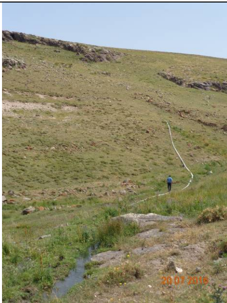
The water pipe-line in the torrent coomb