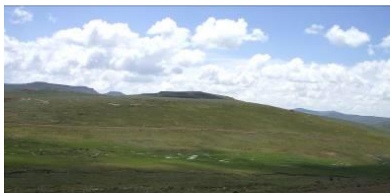
Figure 2 – Rehabilitated wetlands at Motete part of Water Sector Pilot project

This has been highlighted in preparing the Basin level Integrated Water Resources Management Plan. The initiatives to address the ecosystems for continued availability of water entail the wetlands protection and