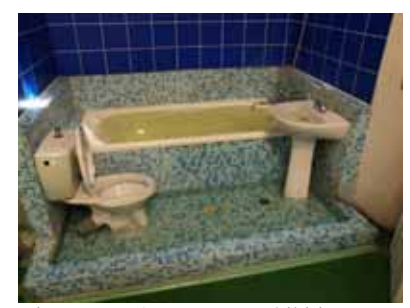
Kiev Water Awareness Exhibition

The workshop was an essential contribution to region-to-region collaboration. It provided mutual exchange of knowledge regarding WSS; it demonstrated a universal application of IWRM tools in spite of the fact that these two regions are at different stages of infrastructure development. CACENA participants learnt that any plans for better delivery of water services to people must be considered in an overall water (and national development) strategy.