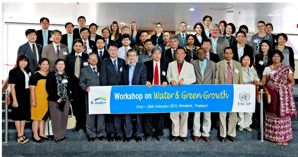
Participants of the Workshop on Water and Green Growth, UN ESCAP, Bangkok, Thailand, 23-25 February 2015