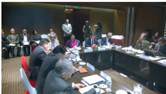
Opening of the 3 rd meeting of AWHoT

During the final session, participants were informed about the next - 4th meeting of AWHoT, which will be held in the framework of the 7th World Water Forum in Gyeongju, Korea on 15 th April. During this meeting, it is assumed the official inauguration of the regional report «Insight into Asian Water». It is also planned to establish Asian Water Council, which will include senior officials from water agencies of the countries - members of AWHoT. The main purpose of the AWC will - to promote mutual commitment on water issues in Asia and ways to solve them on the basis of consensus - beyond the 7 th World Water Forum.