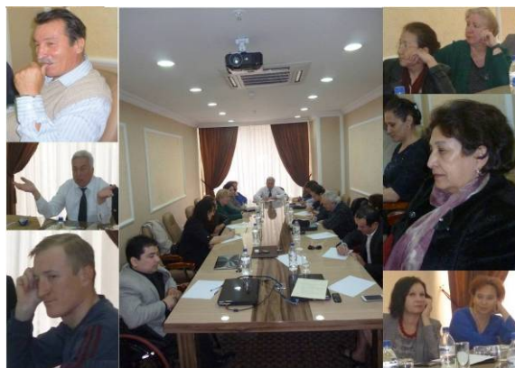
12 Марта 2014. Круглый стол для общественных организаций

Возможности более широкого привлечения общественности к реализации национальных стратегий и программ, по рациональному использованию природных ресурсов, а также обсуждение вопросов устойчивости НПО в Туркменистане