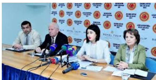
Press Conference on March 18, 2014