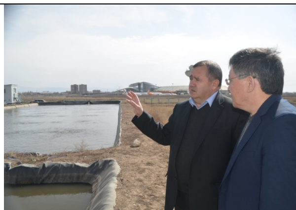
At the construction site

On March 10 , the tender board opened the bidding documents submitted by four construction companies. Company "EMOSHIN" that offered the lowest price for construction was chosen.