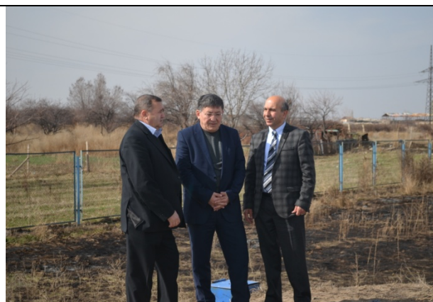
From left to right: Mayor of the Parakar village, WACDEP CACENA Programme Manager, Detailed Engineering Contractor