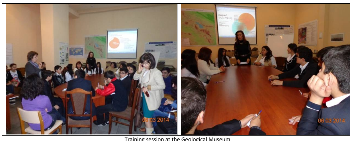
Training session at the Geological Museum

On March 7, at the Geological Museum a training session was organized for high school students. Also the students from YSU Faculty of Biology and Department of Biochemistry, as well school teachers, and museum staff attended that session.