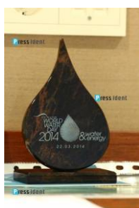
The Photo Competition Prize

More information: http://www.panarmenian.net/arm/photoset/all/5916 ; http://www.aravot.am/2014/03/20/442807/