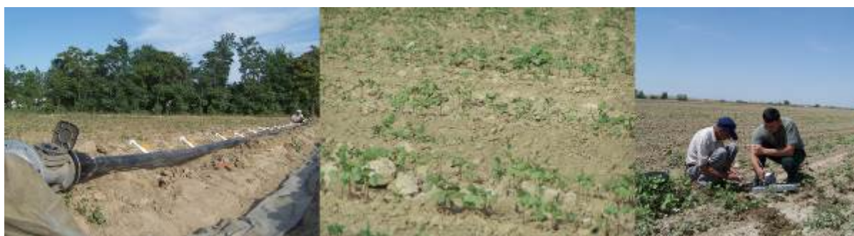
Field works at the pilot plot

Implementation of administrative and technical measures (mounting of irrigation system, land treatment, tillage, land grading, preplant watering, cotton sowing), collecting and processing of analytical materials.