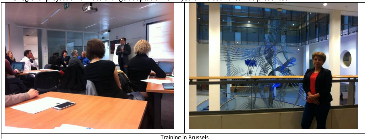
Training in Brussels

The regional project on climate change adaptation for 2 years in 6 countries was presented.