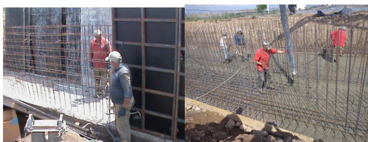
the sludge bank construction

The construction works are going on a full scale. Currently the sedimentation tank of concrete and the sludge bank are being constructed.