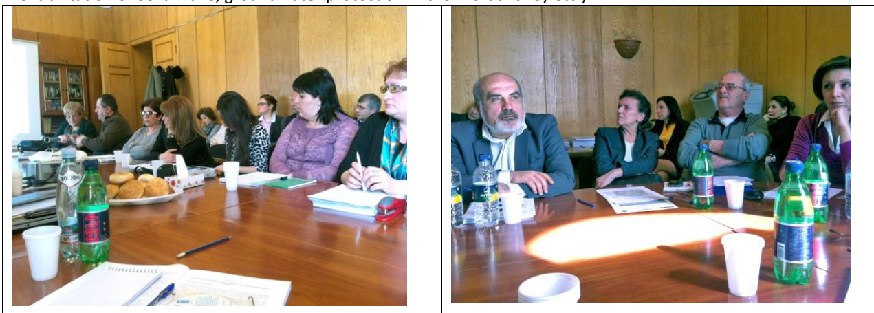
The kickoff workshop on the project "Promoting dialogue between the management system and NGOs within implementation of the "Post-Rio +20" process in Armenia"

Currently Association is preparing the project on water resources that will include all the "hot spots" on water resources management and use (particularly, issues on wastewater treatment plant construction, rehabilitation of Sevan lake, groundwater protection in the Ararat valley etc.).