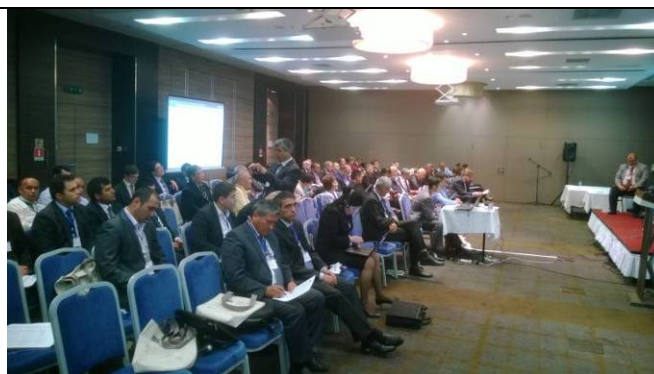
Working moments of the Conference