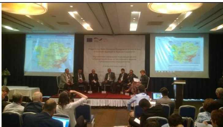
Panel discussion of basin representatives during the Conference