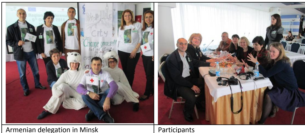
Armenian delegation in Minsk