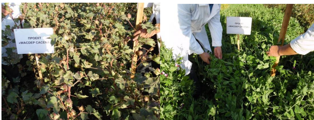
Cotton after the wheat harvest on 16 October 2014 Pea after the grain maize harvest on 16 October