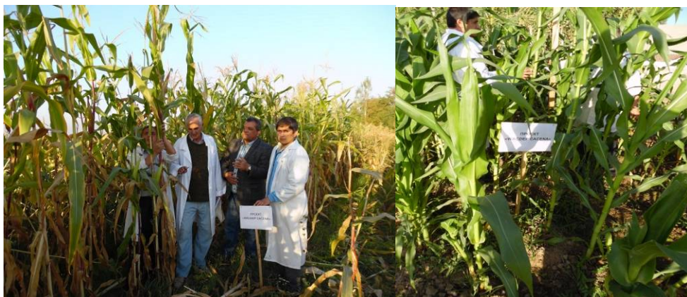
Grain maize after the wheat harvest on 16 October 2014 Corn (silos) after the grain maize harvest on 16 October