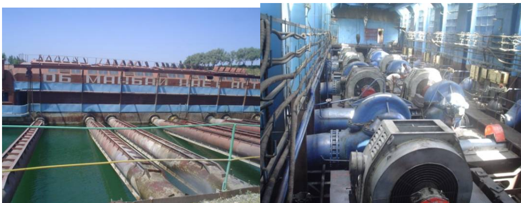
Khodjabakirganskaya floating pumping station