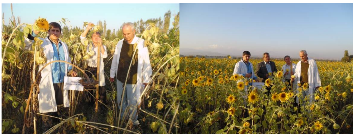
Sunflower after the wheat harvest on 16 October 2014 Sunflower after the grain maize harvest on 16 October

According to the work plan on the demonstration project within WACDEP CACENA in 2014 there were 2 harvests on each plots obtained by means of water saving technologies and environment protection methods: 2 grain harvests (wheat+corn); 2 fodder crops (corn+sunflower). Cultivation technology for "wheat+cotton" and "wheat+ winter crops (rape, rye, pea, chickpea)" was demonstrated. Regular meetings with farmers, agricultural specialists are being organized.