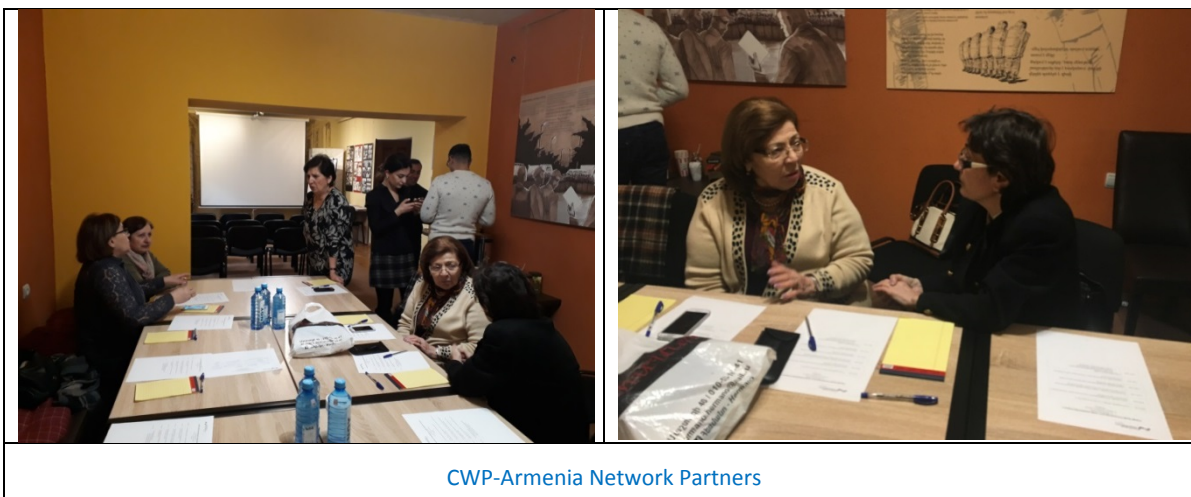
CWP-Armenia Network Partners