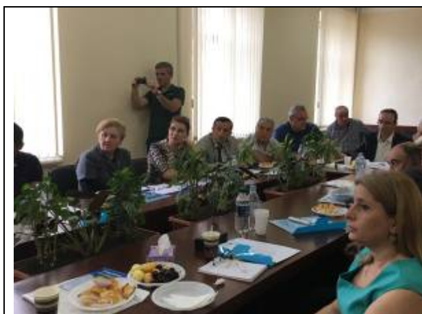
Meeting in Vanadzor

It was decided to hold a national seminar "From Paris to Marrakesh" in mid-October in cooperation with the Climate Centre. The article about this seminar was published in the local newspaper "Asparez".