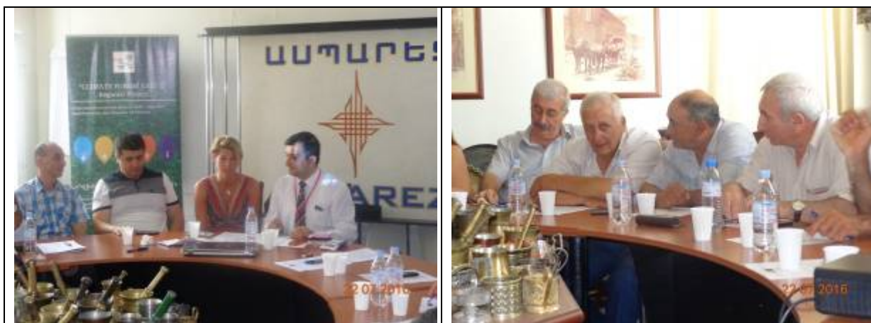
Meeting in Gumri