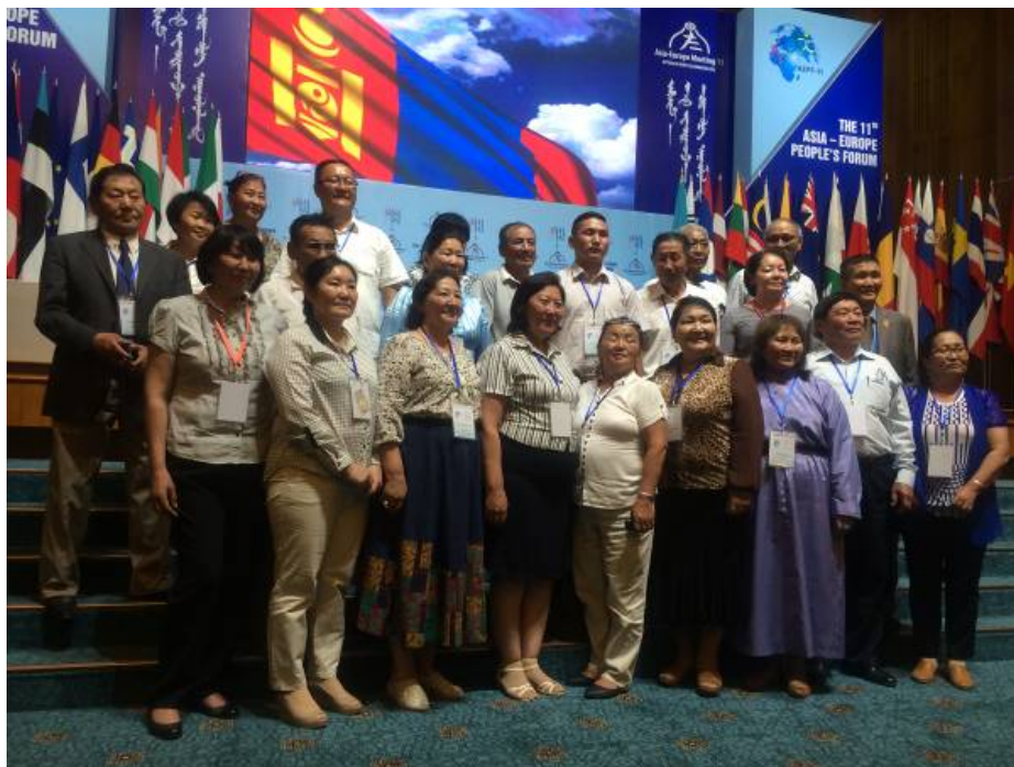
NGOs delegation at the 11th Asia-Europe People's Forum