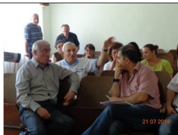
Meeting in Margaovit