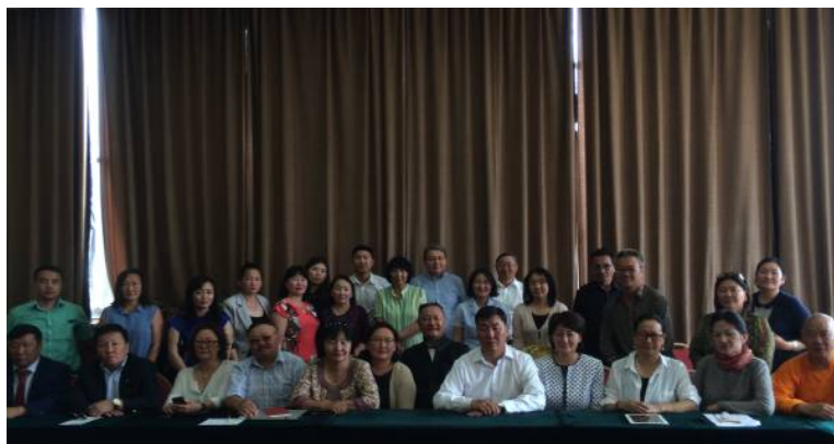
Partners of CWP-Mongolia and GWP chair