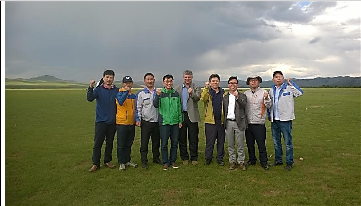
During the field trip to the site area of the future water reservoir in the Tuul river basin