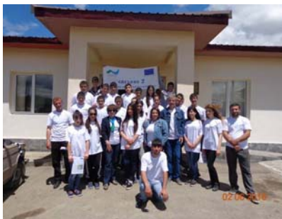
In front of administration building of Mez Parni village

At the beginning of the event, in the hall of the village municipality, schoolchildren received T-shirts with logos of Kura-Araks and GWP and the leaflets. The purpose of this event was to inform schoolchildren about the vital importance of the Kura and Araks rivers for development of the region, about value of conservation of river ecosystems at national and regional levels, as well as to involve them into the environment protection process.