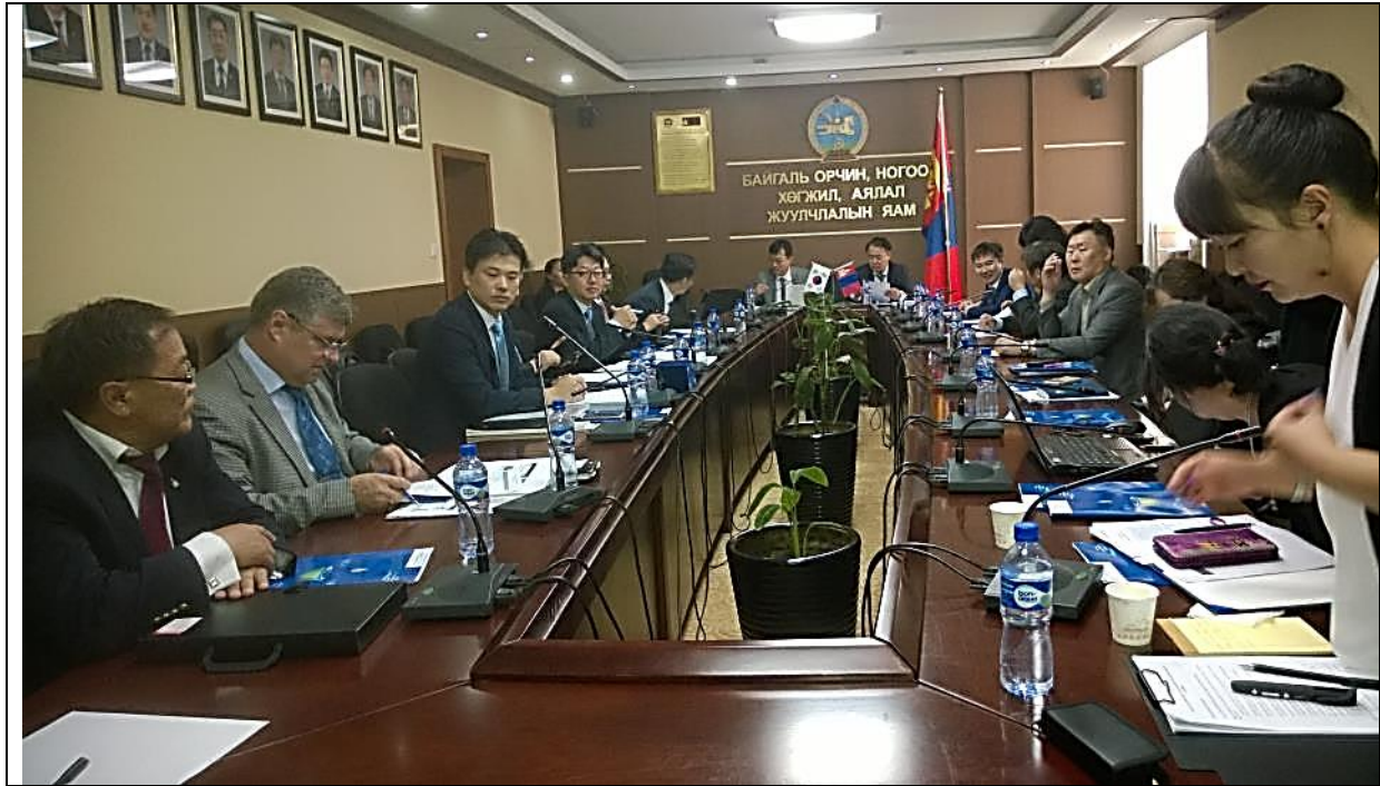
The kick-off workshop in the Ministry of environment, green development and tourism of Mongolia

The objective of the workshop was to initiate the Mongolian Water Project and to evaluate the current water management practices in Mongolia and to recommend the Implementation Plan to raise up the efficiency based on WEF nexus approach. The evaluation and recommendation for the Mongolian water management plan will be carried out on the basis of the National Water Program until 2030, linking with the international development agendas such as SDGs and Paris Declaration.