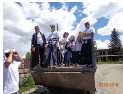
Participants before the trip to Trchkan

Then schoolchildren went to the Trchkan waterfall (15-km from the Mez Parni village), formed by the left feeder of Chichkhan river (Pambak river), in the border area of Shirak and Lori regions. Thanks to the activity and enthusiasm of all the participants, the green area around the waterfall was carefully cleaned from the domestic waste. All collected waste was transported to the landfill of Spitak town.