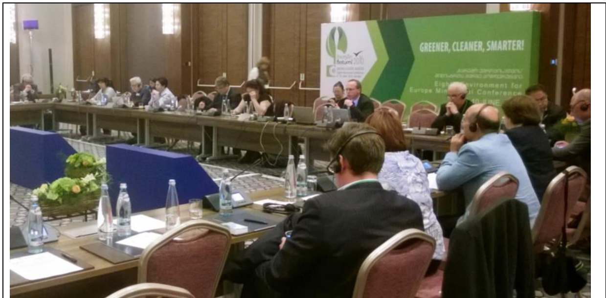
Working moment of the side event