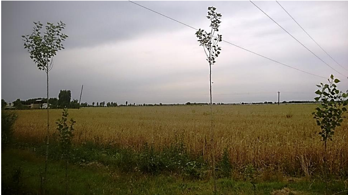
Wheat in the Fergana Valley