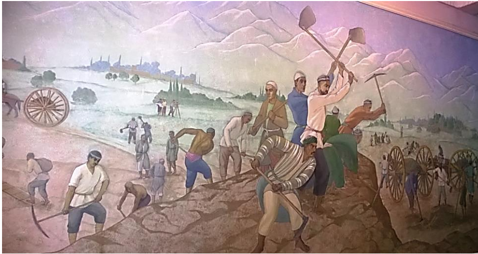
On the wall picture in the Main Administration of Fergana Irrigation Systems: showing the Great Fergana Canal construction in 1939 by 160,000 Uzbek and Tajik workers, who created canal 270 kilometers long within 40 days.