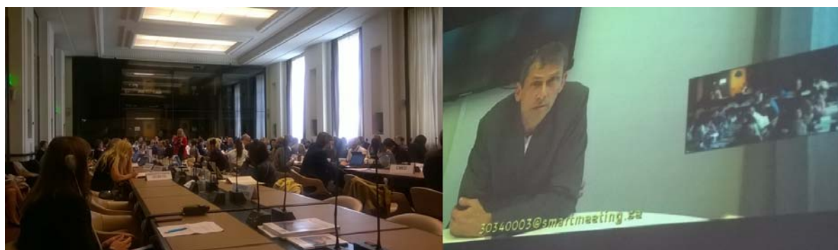
Geneva, 16 June 2016

The Working Group reviewed the implementation of the current work programme and discussed a number of items, including, progress achieved in promoting access to information, public participation and access to justice, and in ratification of the Convention's amendment on genetically modified organisms; financial matters; and promotion of the Convention and relevant developments and interlinkages.