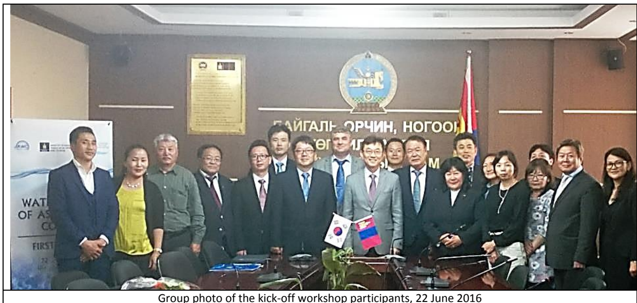
Group photo of the kick-off workshop participants, 22 June 2016