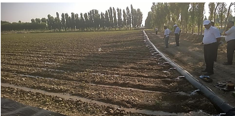
Irrigation of cotton field with flexible pipe