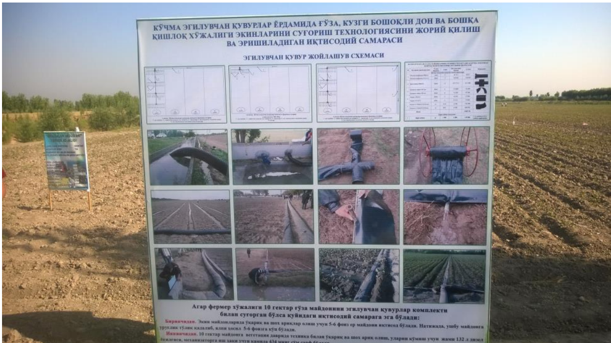
Demonstration of different water saving technologies at the field level