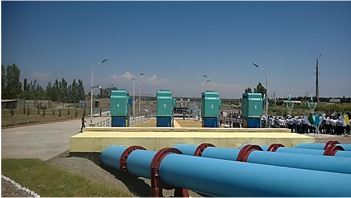
Opening Ceremony of the newly constructed Dargana pumping station