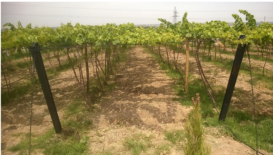
Drip irrigation system on vineyards