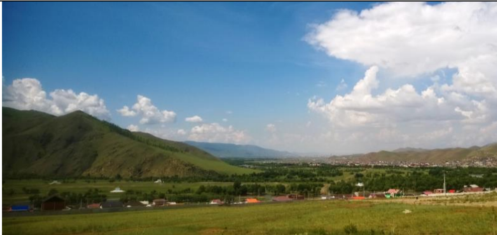
Visiting the Gachuurt ground water in the floodplain of Tuul River. View to the Ulaanbaator city from the top of the hill where main water reservoir of this system is located (about 18 kilometers distance).