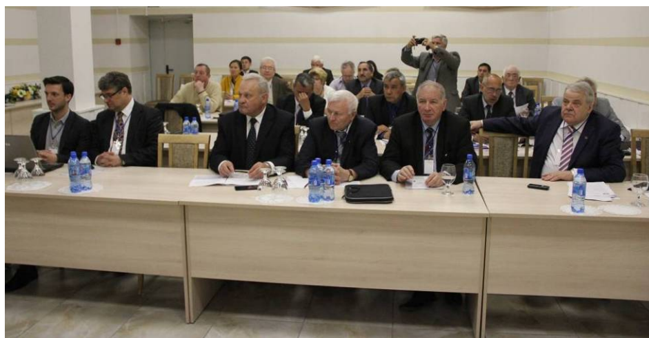
Participants of the conference