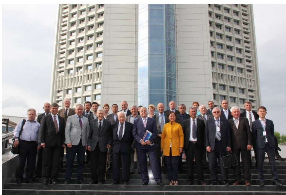
Group photo of the INBO-EECCA conference participants in Minsk