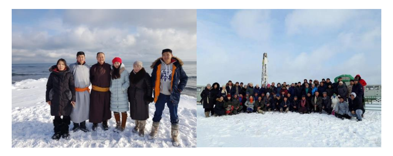
Ubs lake basin - the World Heritage part