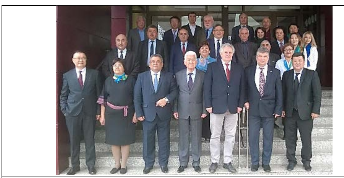
Group photo of the GWP CACENA meeting in Bishkek

Then participants discussed GWP Strategy to 2020 - what we need to change at the country and regional level on the agenda of the Water Partnership Network on the Road to Water Security. In this line also was discussed GWP CACENA regional work plan for 2018 (the core budget activities)