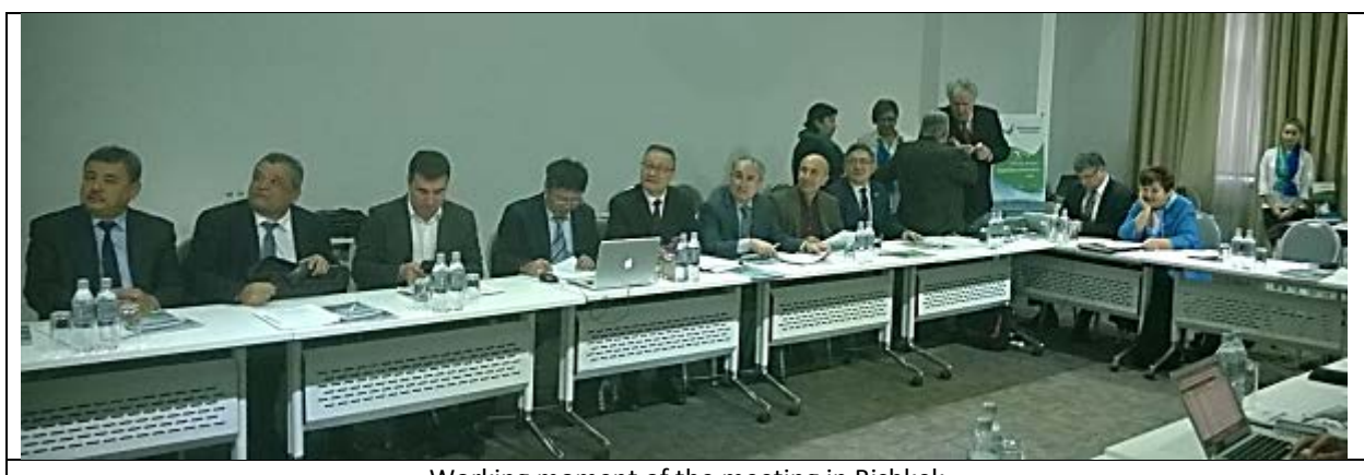
Working moment of the meeting in Bishkek

The special session was addressed to results of the Gap assessment in the implementation of the Paris Agreement on Climate Change (executed by external expert Andriy Demydenko from Ukraine), and discussion of the WACDEP project work plan and budget for 2018-2019