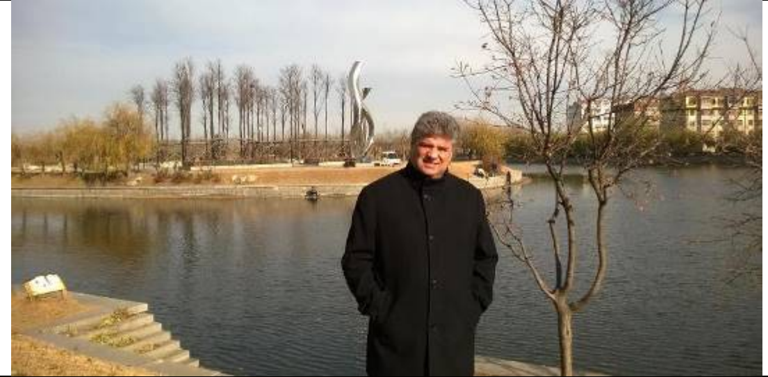
On Day 3, participants joined a field visit to sites of the ADB Qingdao Water Resources and Wetland Protection Project and heard presentations by the project team

The workshop has been proceeded during three days. During Day 1 and 2, expert resource speakers presented and facilitate discussions on topics including river basin management approaches, water conservation techniques, and eco-compensation programs. Country delegations presented their experiences with river basin management.