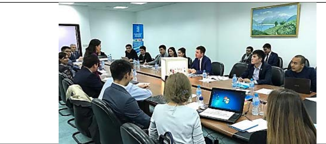
The special session was organized with participation of young water professionals to address the water use related issues.

The Conference was attended by about 250 representatives of various national, regional, and international organizations from more than 15 countries, including representatives of embassies, UNDP, German Society for Cooperation (GIZ), ADB, WB, OSCE, UNESCO, International Commission on Irrigation and Drainage (ICID), Geneva Water Hub, International Network of Basin Organizations, Global Water Partnership for Central Asia and Caucasus, National Water Partnership (NWP) GEF Agency of the International Fund for saving the Aral Sea in Uzbekistan, Basin Water Organizations of Amu Darya and Syr Darya, Central Asian Regional Environmental Center.