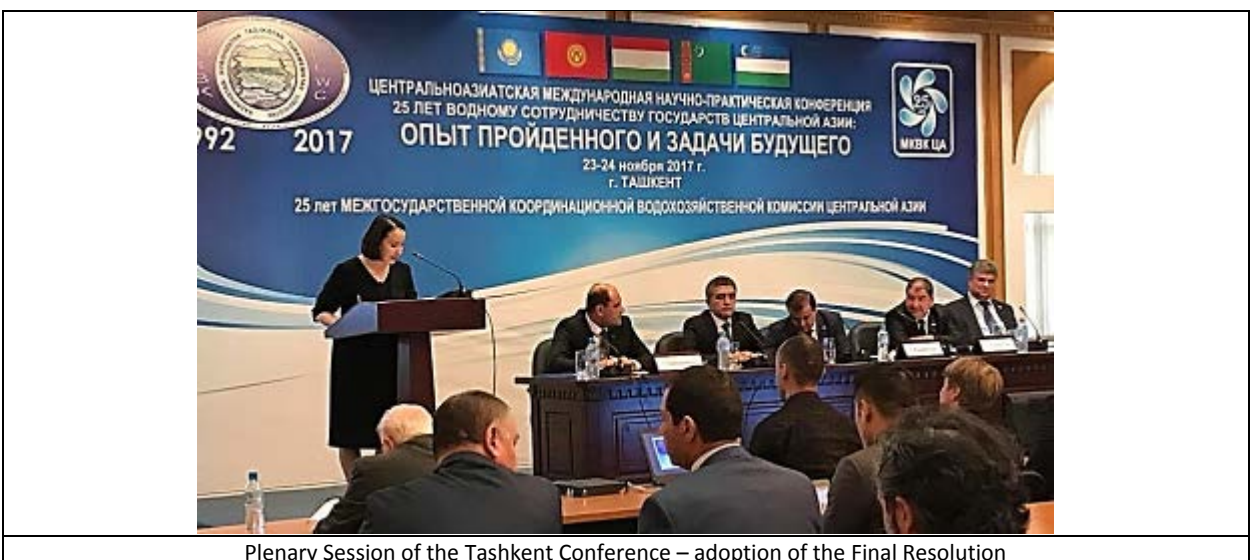
Plenary Session of the Tashkent Conference – adoption of the Final Resolution

Finally, the Conference adopted its resolution, see in: <a href="http://sic.icwc-aral.uz/releases/eng/322.htm">http://sic.icwc-aral.uz/releases/eng/322.htm</a>