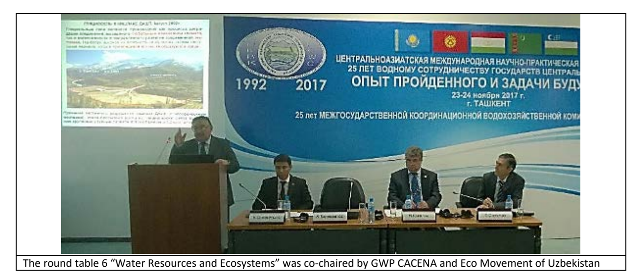
The exhibition showcased best practices and scientific achievements in the area of water conservation and sound water use, automation of waterworks facilities, metrology and up-to-date water accounting facilities.

A Symphony for Water and Peace composed progressively during two years as the Panel convened in different countries (Switzerland, Senegal, Costa Rica, and Jordan) was performed at the Gala anniversary dinner.