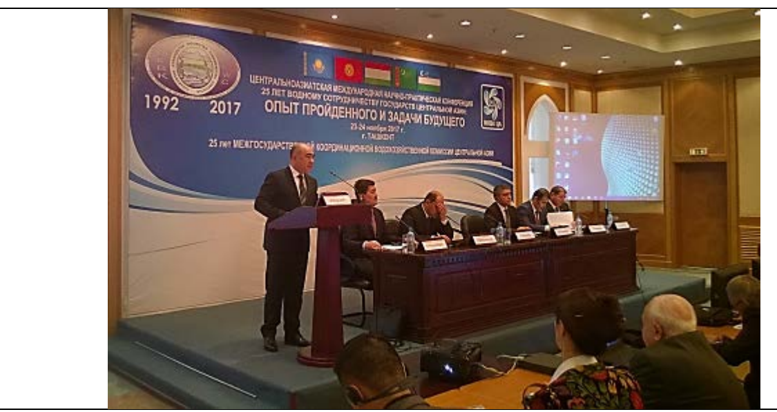
At the opening ceremony, Deputy Premier of the Republic of Uzbekistan and Minister of Agriculture and Water Resources Mr. Mirzaev welcomed the participants on behalf of the Government of Uzbekistan.

The Conference was attended by about 250 representatives of various national, regional, and international organizations from more than 15 countries, including representatives of embassies, UNDP, German Society for Cooperation (GIZ), ADB, WB, OSCE, UNESCO, International Commission on Irrigation and Drainage (ICID), Geneva Water Hub, International Network of Basin Organizations, Global Water Partnership for Central Asia and Caucasus, National Water Partnership (NWP) GEF Agency of the International Fund for saving the Aral Sea in Uzbekistan, Basin Water Organizations of Amu Darya and Syr Darya, Central Asian Regional Environmental Center.