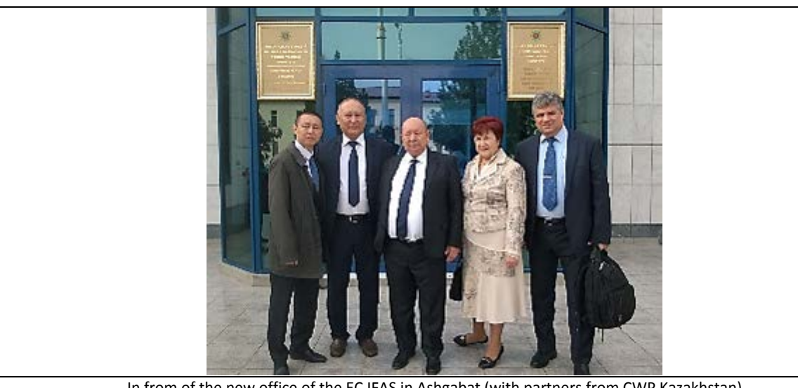
In from of the new office of the EC IFAS in Ashgabat (with partners from CWP Kazakhstan)

In particular, coordination of measures to support and update the Regional Environmental Action Plan (REAP) was discussed. The document has been approved by the IFAS Board in 2003 in five priority areas: water pollution, waste management, degradation of mountain ecosystems, land degradation, air pollution. In connection with the adoption by the Central Asian countries of the Sustainable Development Goals and the Paris Agreement, it has become necessary to revise this document in the light of global and regional agenda.