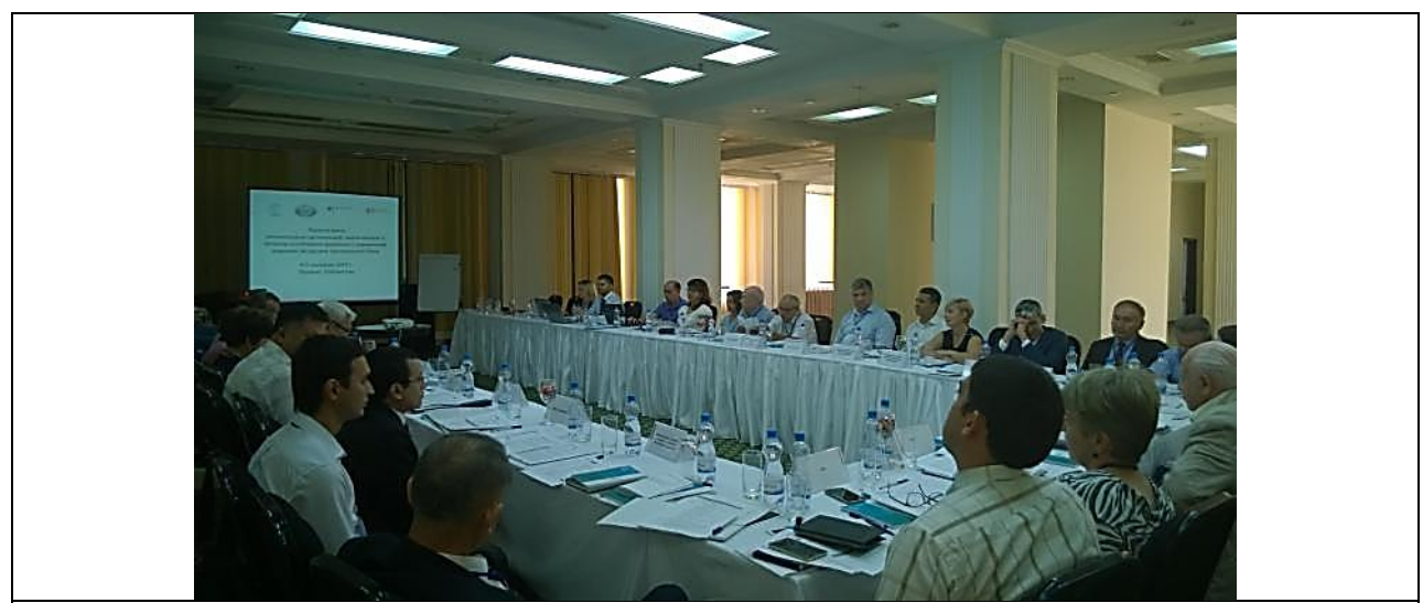
The participants shared the results related to the assessment of needs and capabilities of regional organizations in mutual training and sharing knowledge and experiences, as well as the results of the joint regional projects.

A special focus was on strengthening capacity of regional and national organizations, including programs on building capacity of experts from water sector and related sectors in the Central Asian states.