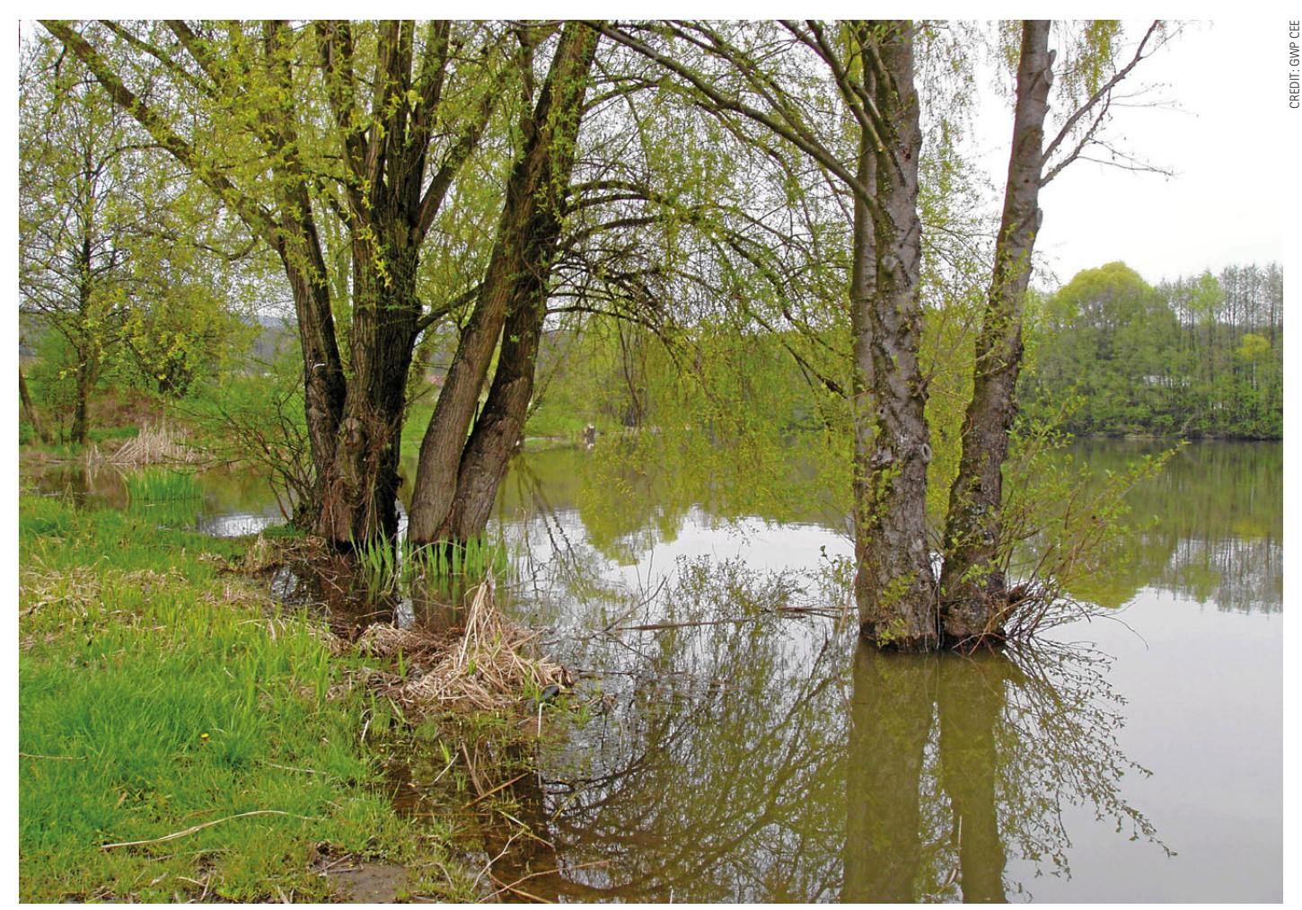
Higher levels of groundwater can flood low lying areas

"Since the main source of the groundwater resources and cause of its changes is infiltration recharge into shallow groundwater, the highest increase of resources is anticipated in shallow groundwater aquifer", says Jurgita Kriukaite, Lithuanian Geological Survey. In the A1B scenario the highest groundwater level is expected in 2025. During that time the groundwater recharge will increase from 45.7 mm/year