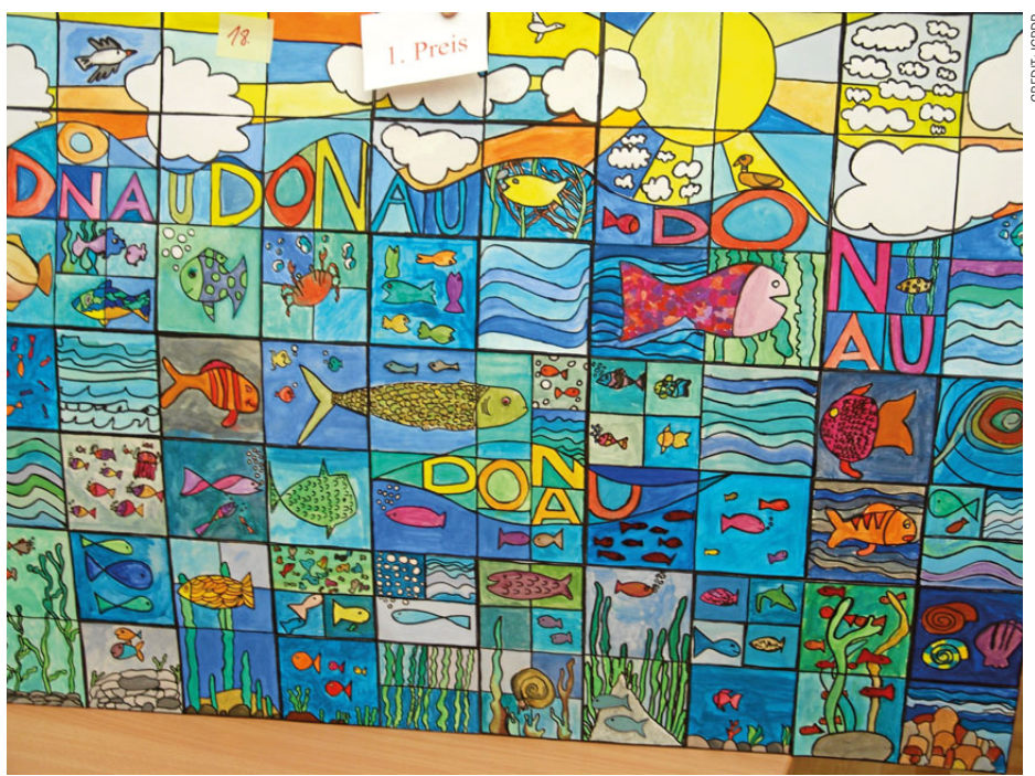
Best art work "Our Danube, a river as variously as we" by students of Secondary School Förderzentrum Neutraubling, Germany