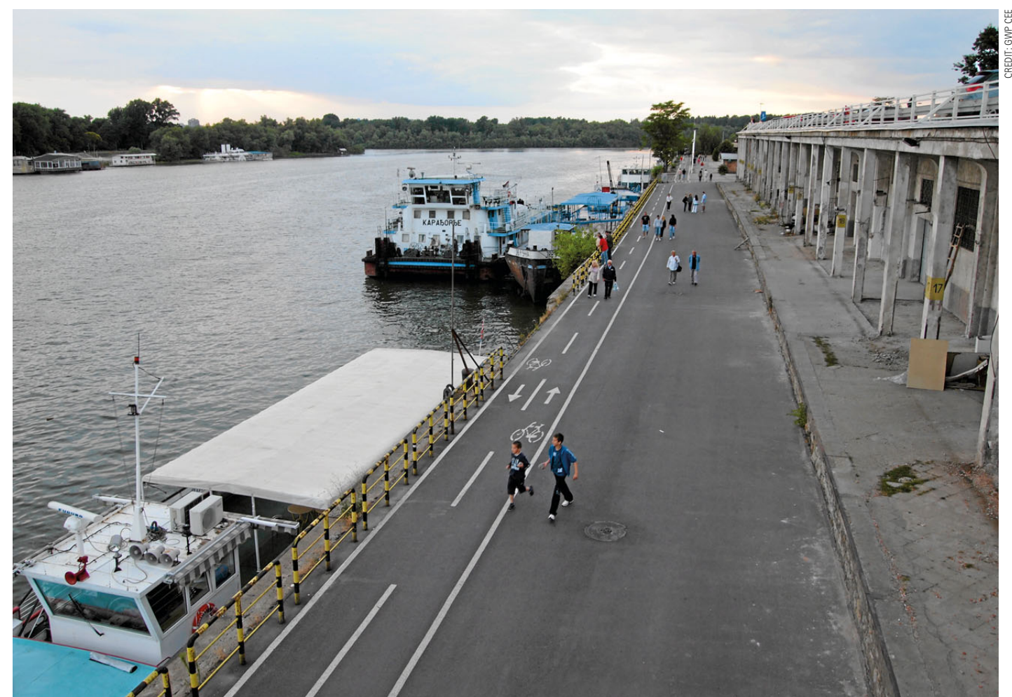
International passenger terminal on the Sava River in Belgrade, Serbia

For more information about Sava River Basin Management Plan: http://www.savacommission.org/srbmp/