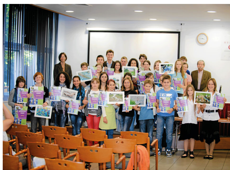
National Danube Art Master winners at the award ceremony

The winning submission was created by 11 German school children from class 5G of the Sonderpädagogisches Förderzentrum Neutraubling. Their artistic painting, entitled "Our Danube - a river as variously as we" is creatively made from colourful patterns and full of references to nature. It represents an appeal to "get active for the rivers", the official slogan of Danube Day 2011.