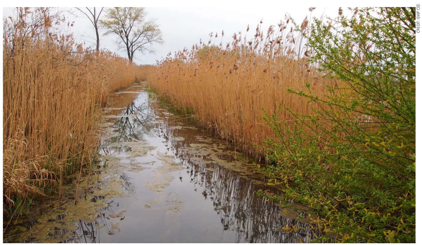
Reed beds are used as a method of removing pollutants from waste water

Next step would be to secure funding for pilot plant to demonstrate feasibility of the technology. GWP CEE has been working on sustainable sanitation since 2007 and since then facilitated several regional and local initiates to advance alternative waste water treatment for the benefit of the people and nature.