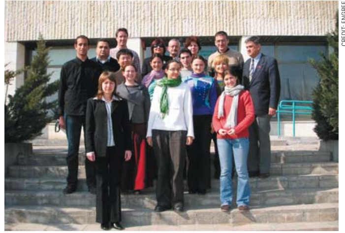
ENGREF team with GWP Consulting Partners in Veliko Tarnovo

ENGREF-Montpellier organized the training in association with the Bulgarian Academy of Science, the Bulgaria Water Partnership, the Regional Inspectorate of the Environment and Water in Veliko Tarnovo and UBI-FRANCE-Bulgaria