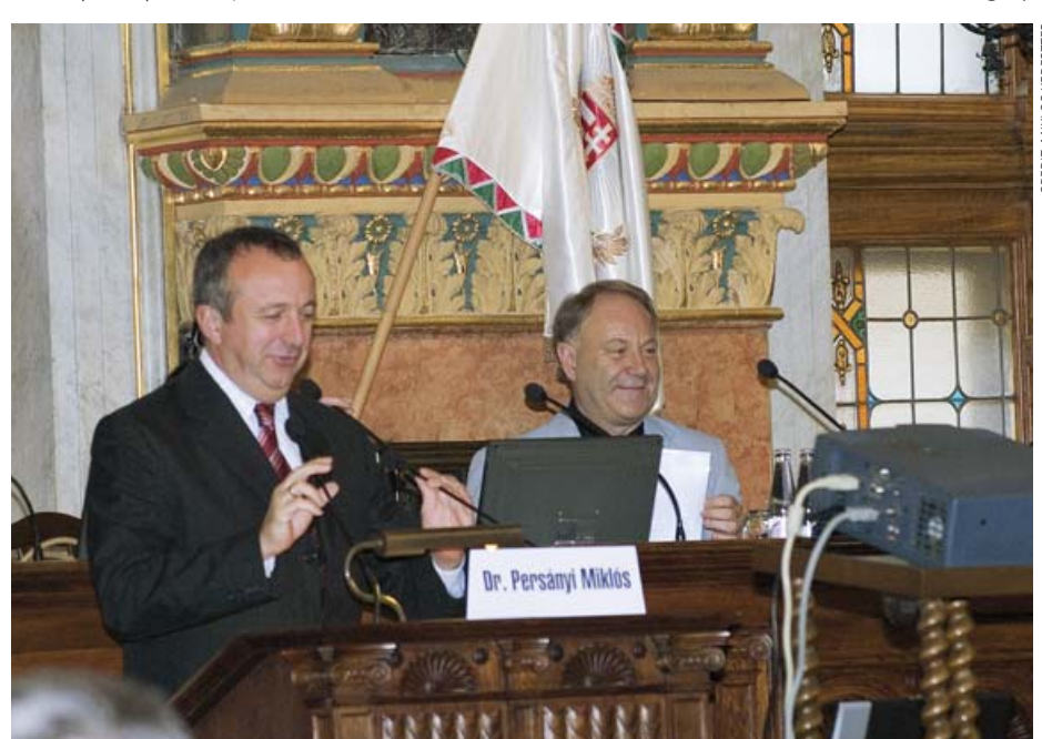
Miklos Persanyi, the Minister of Environment, opened IWRM National Dialogue