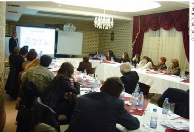
IWRM National Dialogue in Bulgaria