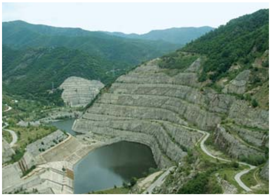
High dam of the Tukavros Lake in Greece on the Mesta (Nestos River) after the border with Bulgaria

FOUR MAIN RIVERS – THE MARITSA, STRUMA, MESTA AND ARDA, SERVE AS WATER LINKS BETWEEN TWO NEIGHBORING NATIONS – GREECE AND BULGARIA. ANCIENT LEGEND SAYS THAT THE MARITSA AND STRUMA WERE ONCE EVEN NAVIGABLE FOR LARGE DISTANCES UPSTREAM, WHILE THE DELTAS OF THE MESTA AND STRUMA WERE USED BY THE FLEETS OF ALEXANDER THE GREAT AND OTHER MILITARY COMMANDERS.