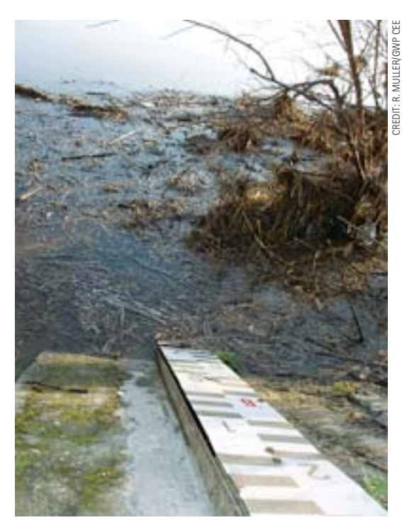
Floods endanger the lives of humans and damage property in CEE

PHARE Program and continuously records the river features based on 13 indicators at the requirement of the Ministry of Environment and Water. In response to the great interest on the part of all the participants, organizers arranged a visit to the wastewater treatment plant in the village of Eleshnitsa, near a uranium mine,