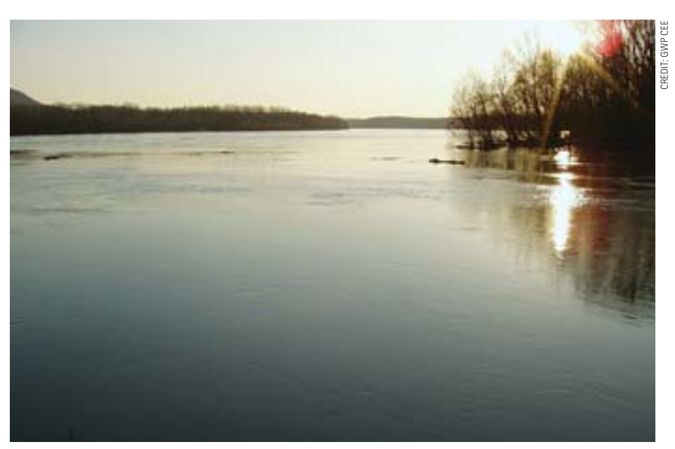
Confluence of the Danube and the Morava Rivers is endangered by periodical floods

ing the most appropriate measures and tools for the integration of warnings in flash flood areas. A team of national experts studied flash floods in Bulgaria, the Czech Republic, Lithuania, Poland, Romania, Slovakia and Slovenia. Based on their findings, a regional synthesis report and project follow up are being prepared.