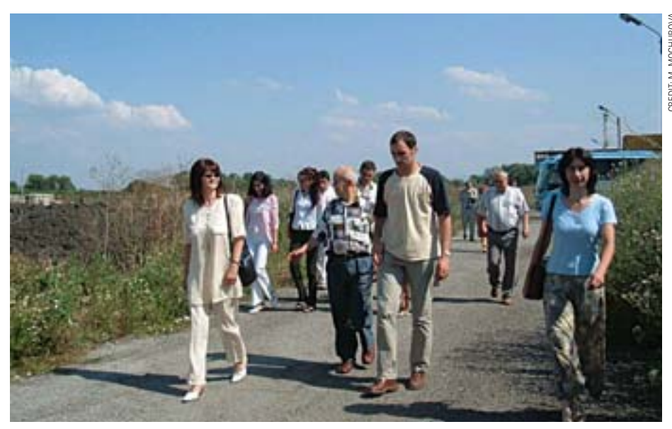
Visit of trainers to waste water treatment plant "Kubratovo"

Although successful participants came from industrial enterprises, basin directorates, non-governmental organizations and consultancies and had different backgrounds and professional experience, they were willing to continue in the implementation of the project "Awareness Raising and Improving the Implementation of Acquis Communitaire in the Water Protection Area" as trainers of enterprises and facilitators of network meetings called "Partnership for Water".