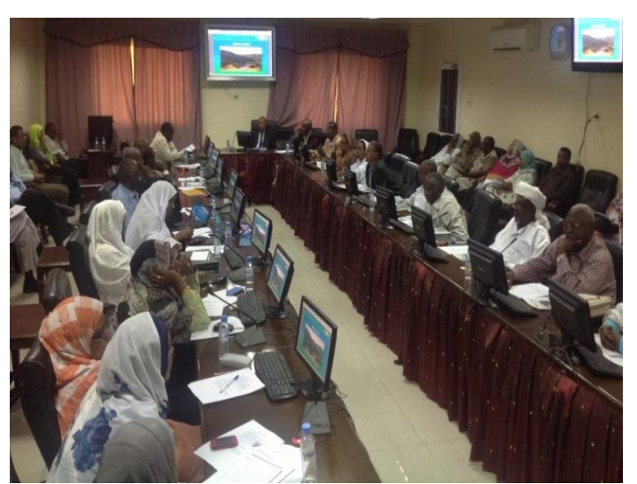
Figure 7: Participants hold discussions

Moreover water is tied to most sustainable development themes – e.g. food, health,