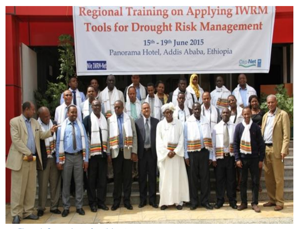
Figure 1: Group photo of participants