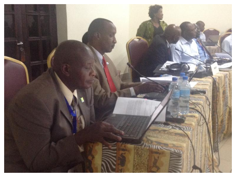
Figure 5: The RC representing GWPEA in the Nile TAC-COM meeting

GWPEA The Regional coordinator presented to the Nile TAC-COM meeting the progress of the ongoing programs of GWPEA such as Partnership and networking as well as its current projects: WACDEP implemented in Burundi and Rwanda, IDMP implemented in the Nile Basin and IGAD Region. Participants commended the good work done by GWPEA in the region and urged both institutions to work together to strengthen