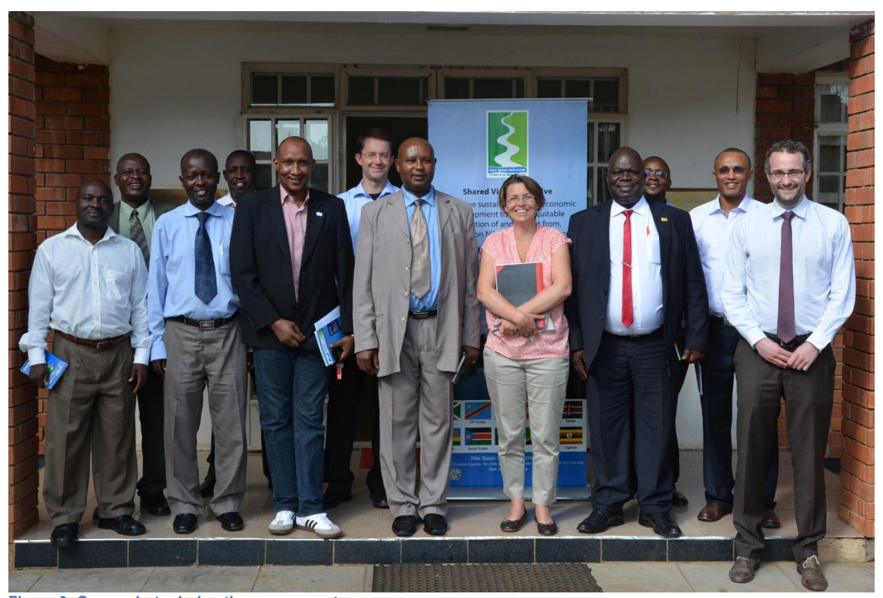
Figure 9: Group photo during the assessment

The results and recommendations of the review are expected to help GWPEA improving its overall performance and better discharge its tasks.