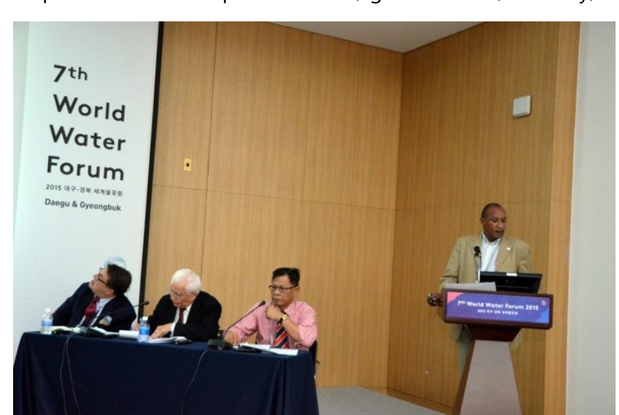
Figure 8: The RC presenting the technical Paper on food security and energy

The World Water Forum is the world's largest meeting on water. Every three years since 1997, WWC has held each World Water Forum on or around World Water Day (March 22<sup>nd</sup>). The World Water Forum consists of at least three processes: the Political Process, the Thematic Process and the Regional Process, while gathering officials, legislators and local and regional authorities from more than 150 nations. Each topic is developed in cooperation with the private sector, governments, industry, IGOs, NGOs and academic