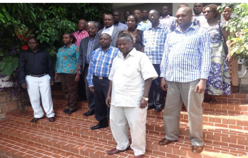
Figure 2: Participants vowed to popularize the new law

The workshop was very interactive and participants were able to ask questions and share experiences from their respective organizations in terms of applying the water and sanitation law.