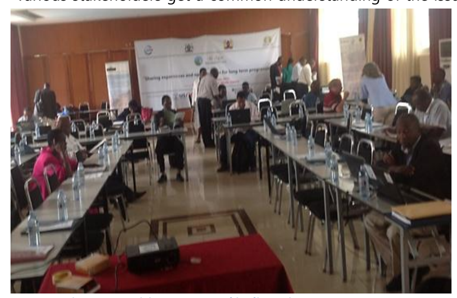
Figure 4: Participants engaged in discussions

The forum was therefore created to provide a platform for coordinating all the efforts within the ecosystem. Since its formation in 2012, the forum has tried to engage more stakeholders and cover wider issues that reflect the inter-linkages within the ecosystem. It provides an opportunity for discussing Mt Elgon issues at a landscape level where various stakeholders get a common understanding of the issues within their landscape,