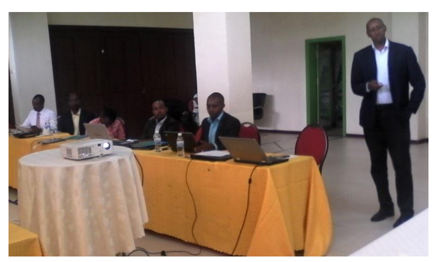
Figure 3: Participants presented their plans