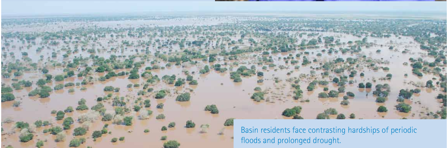
Basin residents face contrasting hardships of periodic floods and prolonged drought.