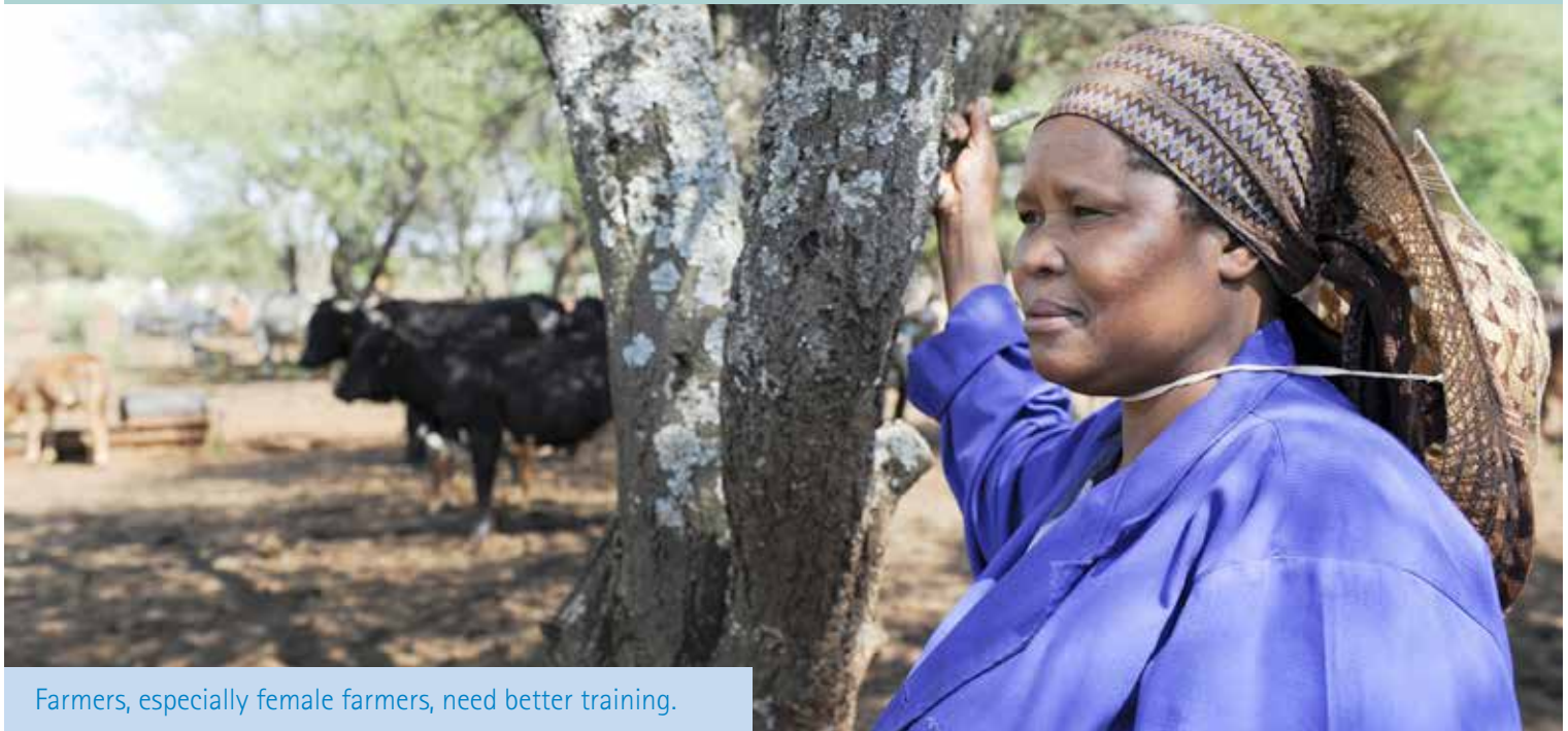
Farmers, especially female farmers, need better training.

CPWF aimed to recognize female farmers' vast contributions to agricultural production and to ensure that they were able to harvest the fruits of their labor. Practical evidence shows that if women are empowered and have control over farming benefits, household livelihoods will improve.