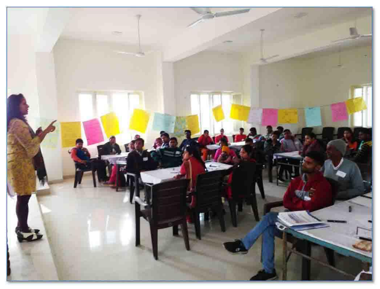
Teachers & Youth participating in Teachers & HYCC capacity building workshop at Vikas Bhavan, Sabhagar, Shamli, December 04 and 05, 2018