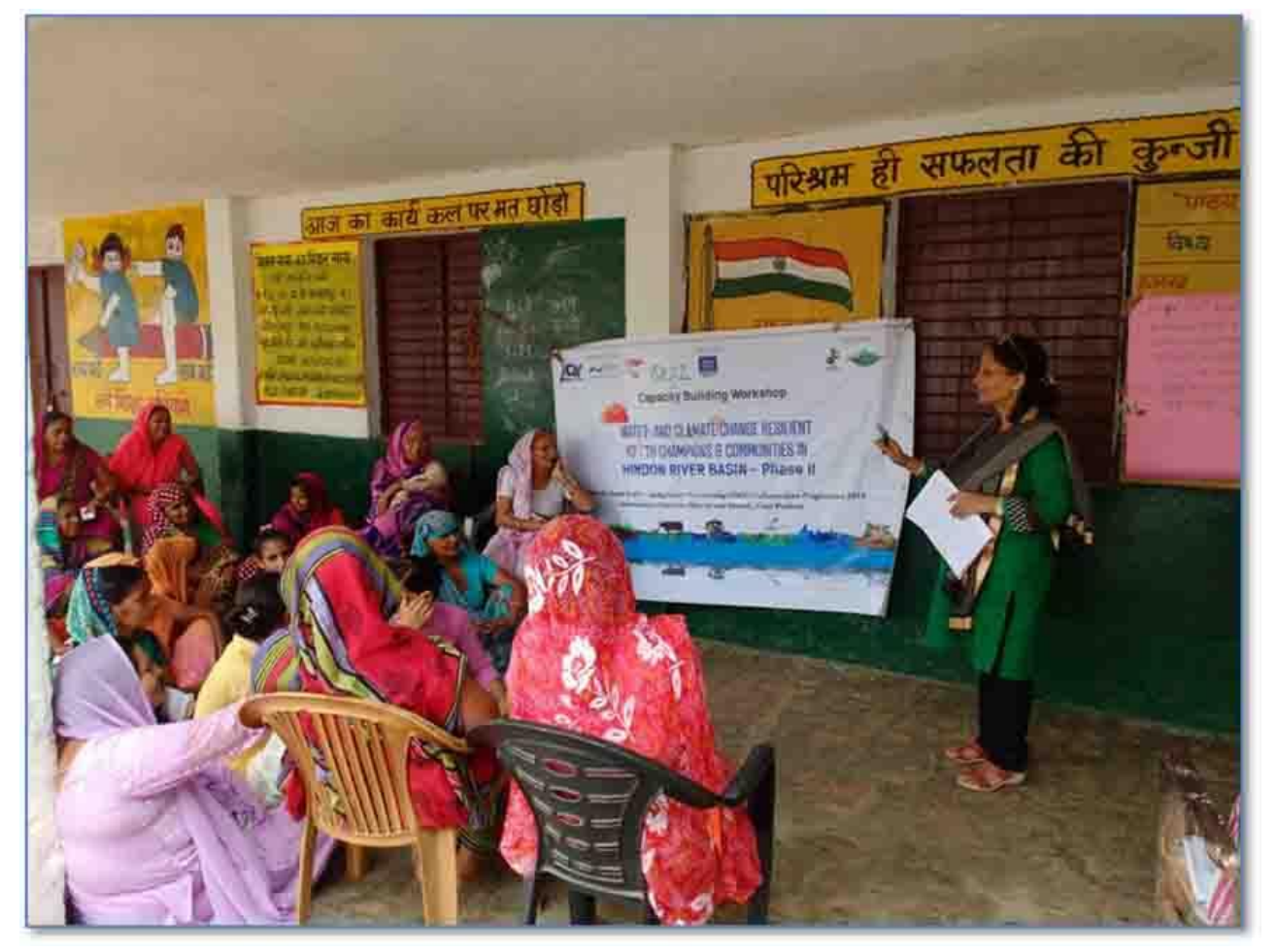
Community women being trained as part of the Capacity building workshop, Kalyanpur, Block Rohta, Meerut

The capacity building workshops for the women and farmer groups engaged close to 90 women and 82 farmers in the four gram panchayats on the two topics. The training empowered them with water saving techniques and alternative farming methods to adapt to and mitigate climate change and water stress. The workshops were held in Kalyanpur, Kaithwari, Mimla and Salfa gram panchayats from July 23-31, 2018.