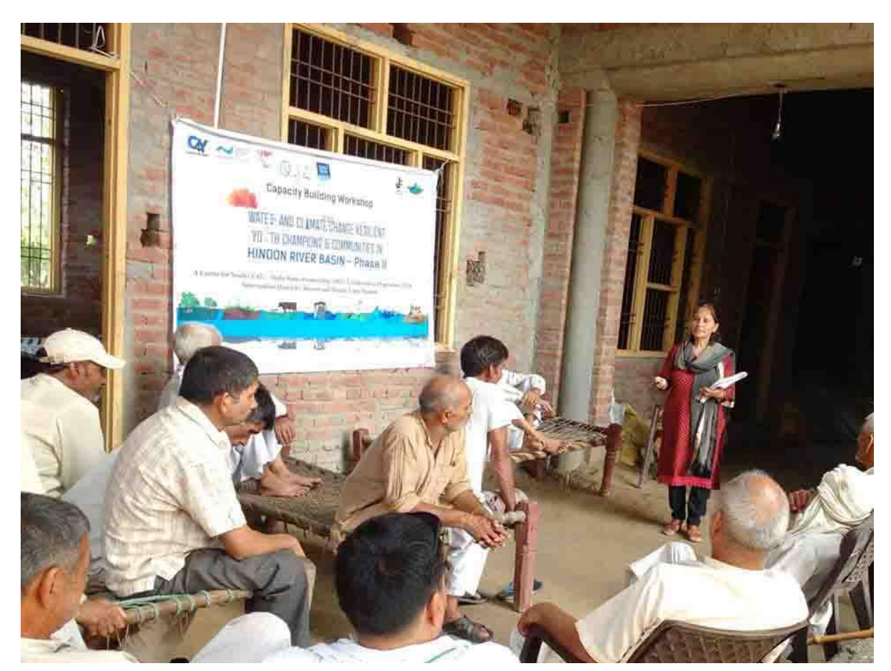
Farmers in Salfa Gram Panchayat attending a capacity building session