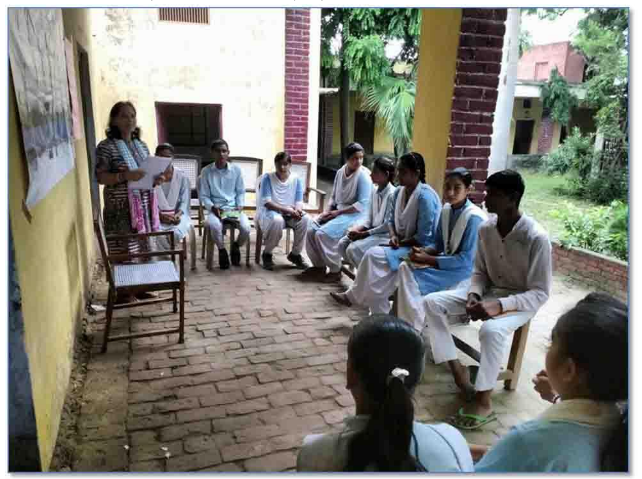
Students of Janta Inter College, Kalyanpur, Block Rohta, Meerut participating in the Hindon Quiz