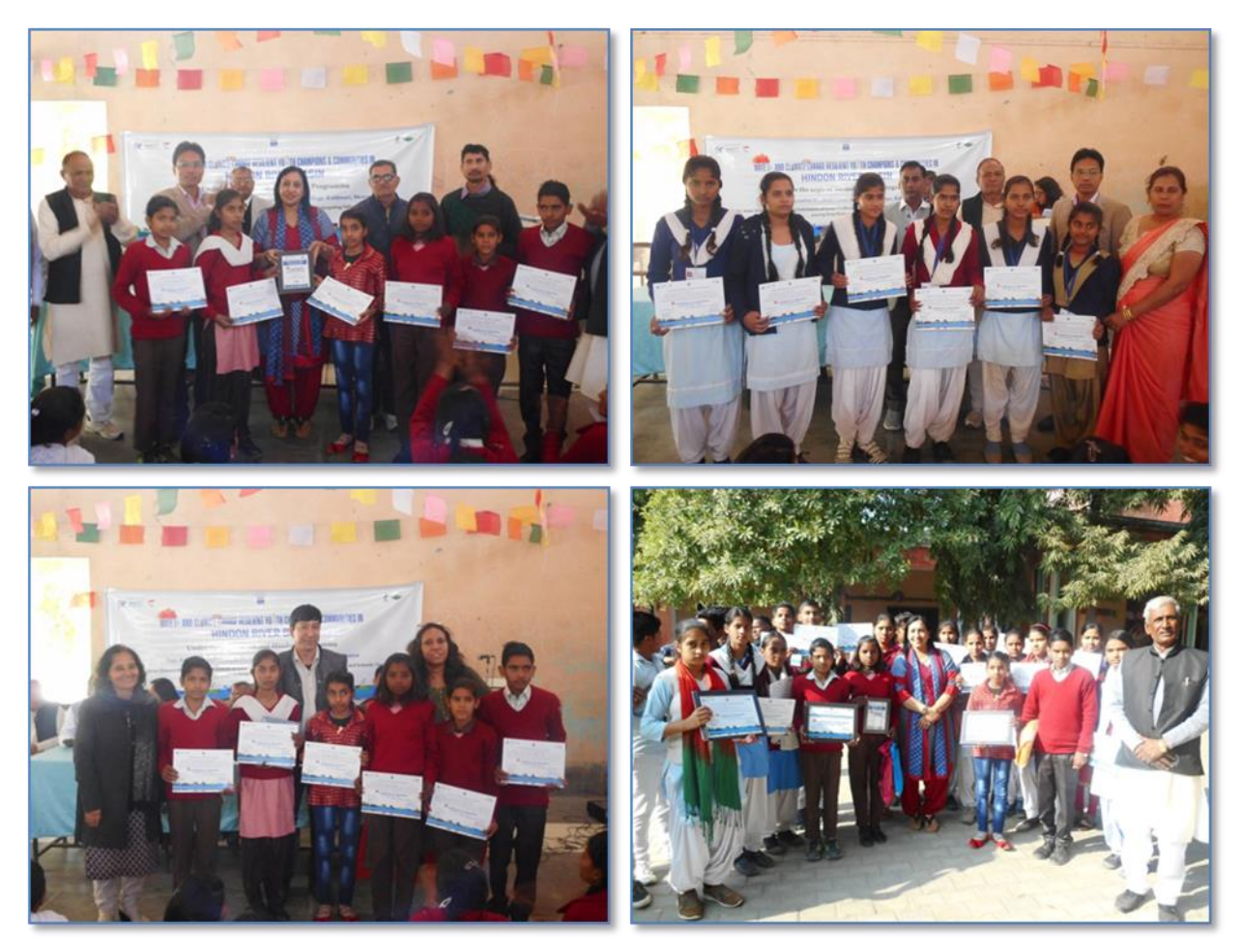
Certificates for the participants of the final round of the Inter-district Hindon Quiz