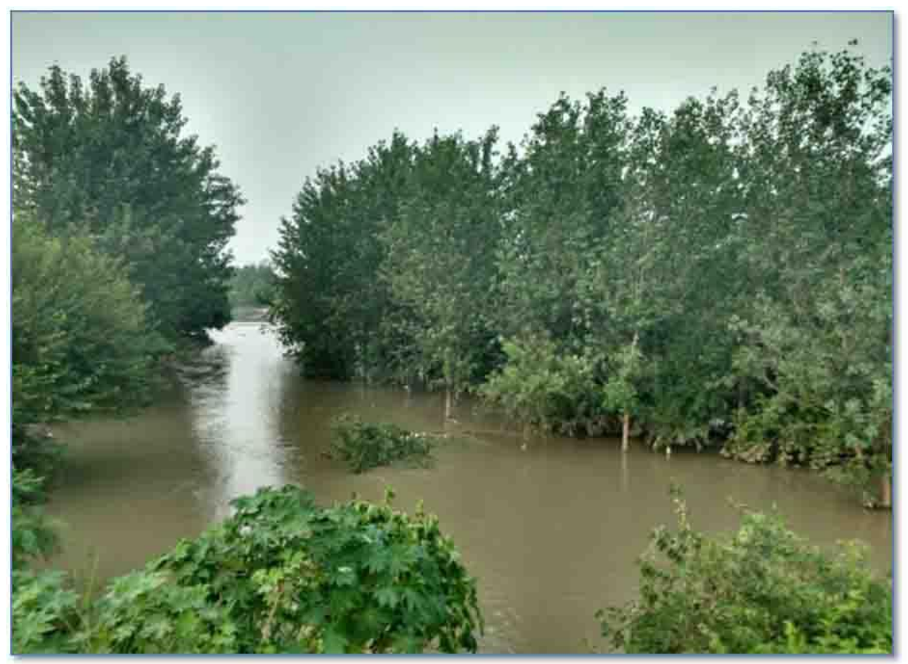
The River Krishna, a tributary of the River Hindon, flows across the village Salfa, district Shamli

Hindon River is a tributary between Ganga and Yamuna rivers, meandering through 355 kilometres across Western UP from Saharanpur to Noida. In Uttar Pradesh, the Hindon River is one of the most negatively affected Ganga sub-basins. The surrounding environment as well as the people depending on Hindon water is severely affected by its reduced water quality and diminishing flows (2030 WRG). There are over 100 drains that fall into the Hindon discharging industrial effluents from sugar, paper, textile, and tannery industries. The second major source of pollution stems from large inflows of untreated sewage from the cities located along the river basin. The Central Pollution Control Board (CPCB) has said that the river is not meeting the criteria with respect to Dissolved Oxygen, Conductivity, BOD, Total Coliform, and Faecal Coliform. River Hindon receives the municipal as well as industrial effluents from the township of Saharanpur, Muzaffarnagar, Shamli, Meerut, Baghpat and Gautam Buddha Nagar. A very high organic load in the river water makes it highly unsuitable for even bathing purposes. Chromium levels within drinking water supplies at Kudhla Village, Meerut district are found to be 140 times the maximum permissible limit for drinking water set by the Bureau of Indian Standards for this heavy metal.