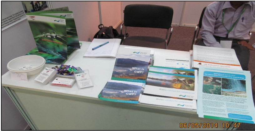
Photo1 : Display of GWP and GWP –India documents at the Exhibition Stall