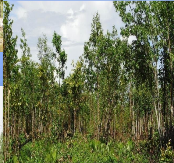
Successful Gap Plantation