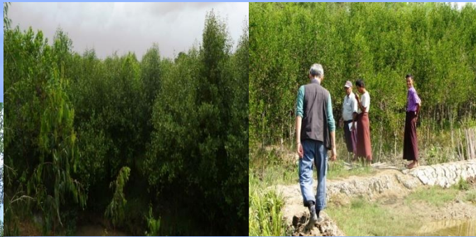
Successful RIF Mangrove