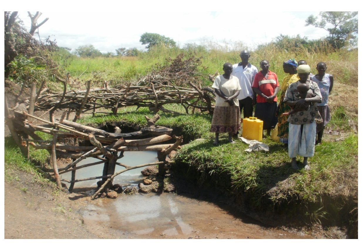
2. Local water point maintained by water user committee (some members in picture)