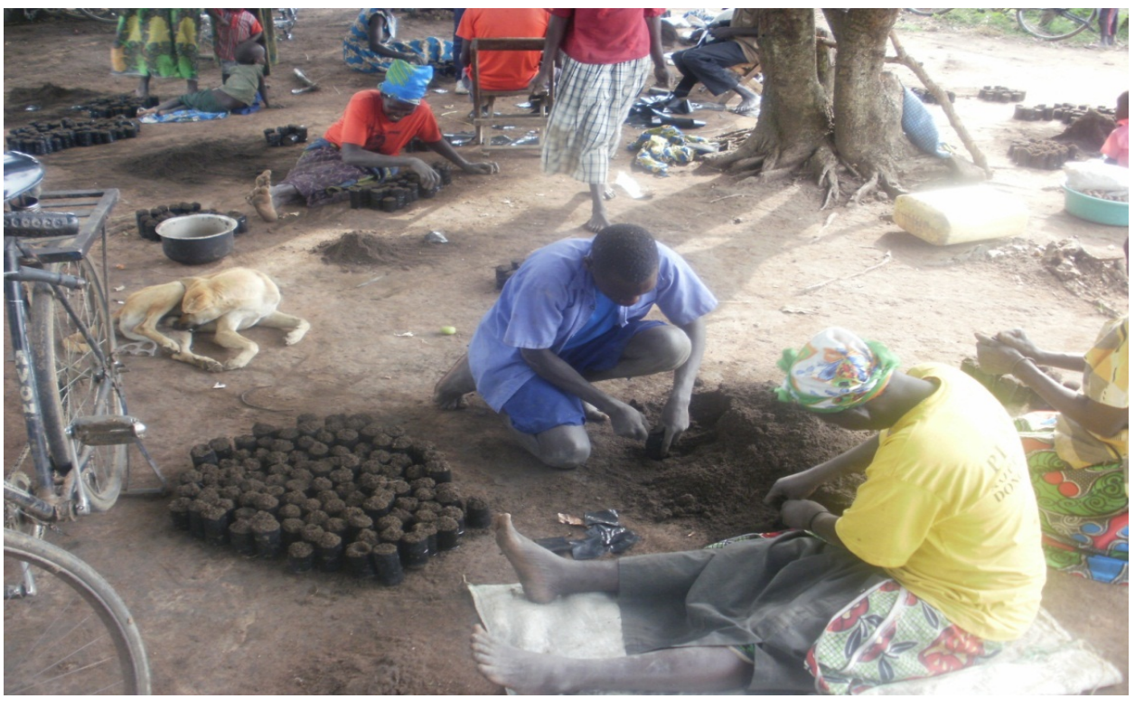
3. Community Members working in their in tree nursery