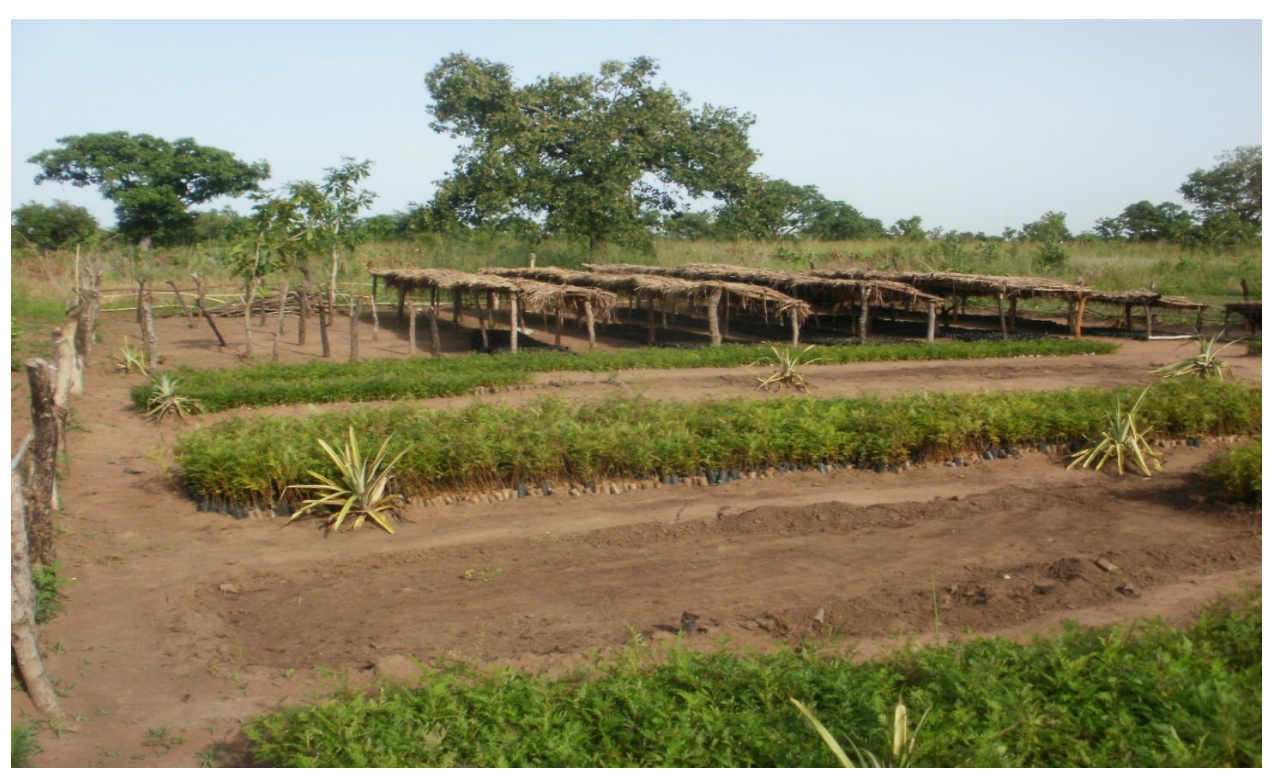
4. A community tree nursery in one of the selected communities in Aswa-Agago Sub-catchment