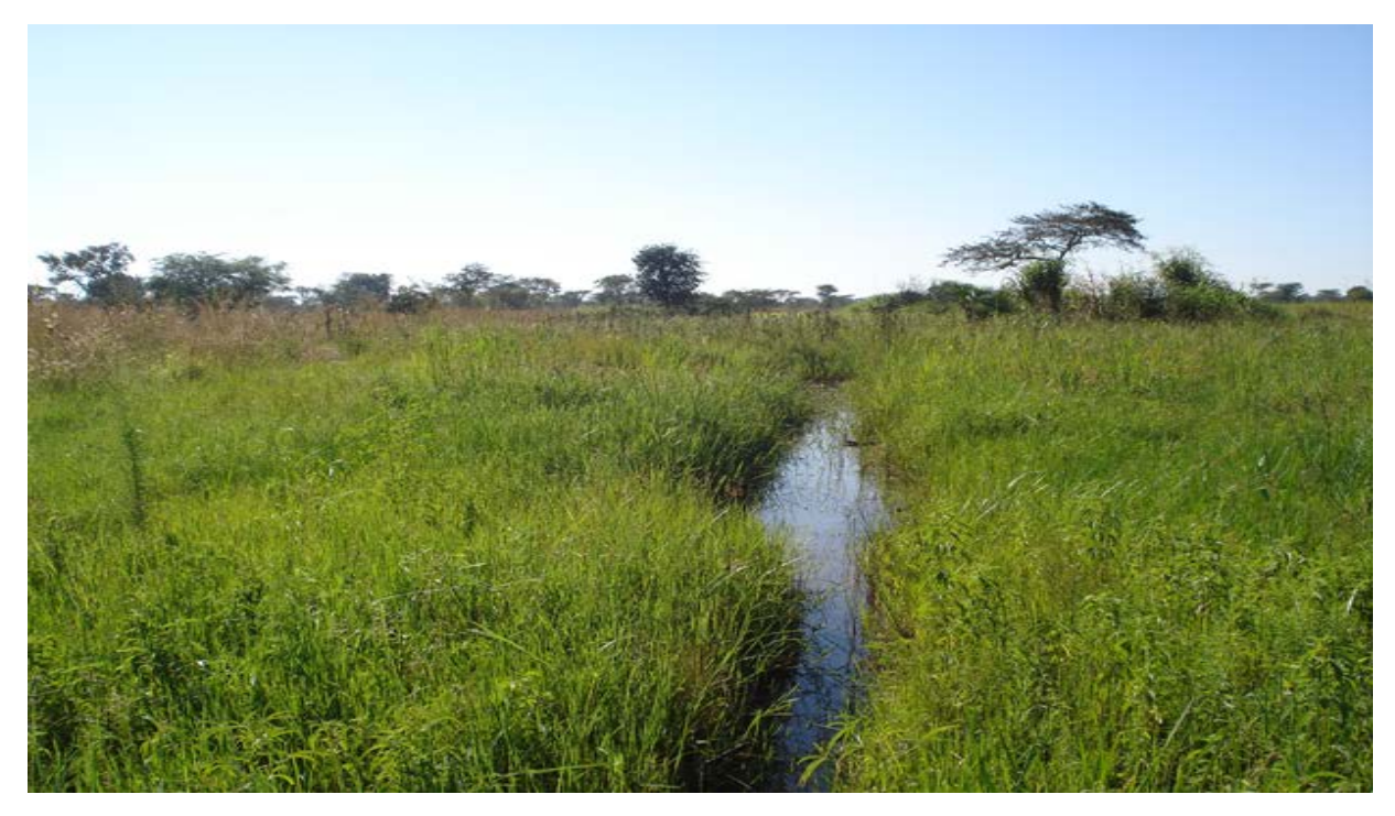
1. Restored wetland in Arwotngo LC I,Okwang Sub-county Otuke District