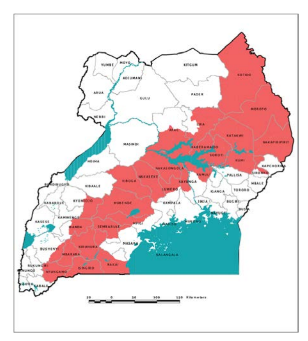
Figure 1. Map of Uganda showing districts in the cattle corridor

The project site lies in the cattle corridor of Uganda (Figure 1) with semi-arid characteristics, variability in high rainfall and droughts.