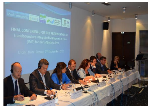
Figure 5: Final Consultation Meeting, Ulcinj, September, 2015 (GWP-Med, 2015)

The Integrated Water Resources Management Plan for Buna / Bojana area (“the Plan”) was developed as a pilot activity in the framework of the GEF UNEP/MAP Med Partnership Project demonstrating the implementation of the new Integrative Methodological Framework (IMF). The IMF supports and enables planners and interested parties to make efficient use of the limited resources in coastal zones. The Plan was completed over a 5-year time frame, with cooperation between Partner Organizations: the Regional Activity Centre for the Priority Actions Programme (PAP/RAC), Global Water Partnership Mediterranean (GWP-Med), UNESCO-International Hydrological Programme (UNESCO-IHP) and two teams of National (Albanian and Montenegrin) experts. The aim of the Plan as defined by the partners was “to support the efforts of the governments of Albania and Montenegro to improve the integrated management of the natural and anthropogenic environments in the Buna / Bojana area” (GWP-Med et al., 2015). Therefore, all partners jointly worked on an integrated approach to establish strategic and national action plans harmonizing legislation between the two countries. The Plan strictly follows the guidelines outlined in the EU Water Framework Directive, the ICZM Protocol, and the IMF but is shaped according to the local conditions and needs of the watershed.