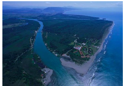
Figure 2: Coastal marine waters in Buna / Bojana river mouth (GWP-Med et al., 2015)

The complexity of the landscape components of the Buna / Bojana watershed, as well as its transboundary nature, make it an interesting case for study and analysis. Natural linkages between lakes and rivers, brackish waters and groundwater, inland and coastal zones in the area as well as the ongoing development of the socio-economic