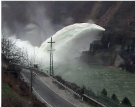
Figure 3: Outflow of the Vau-I-Dejes dam, January 2010, (GWP-Med et al., 2015)

According to the World Bank, the Southeast Region of Europe will be severely impacted by global warming. Climate change variability, mainly reflected by temperature increase, extreme weather events such as droughts and flash floods, low precipitation, and sea level rise, highly impact the situation of the area, putting its households and agricultural land in danger. Sea level rise and storms