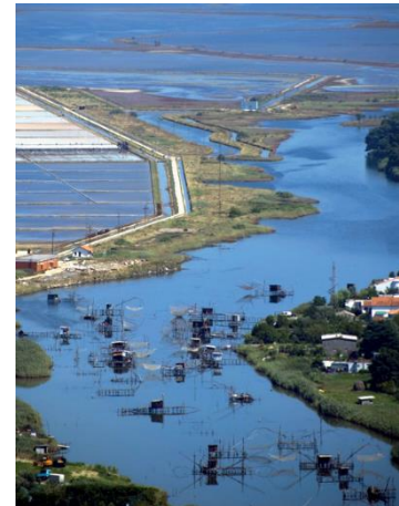
Fig. 4: Unsustainable fishing methods, (GWP-Med et al., 2015)

Construction has expanded due to increased urban development after the 1990's, affecting mainly the coastal zone and urban centers. The lack of a sustainable planning strategy in Albania and a poor strategy in Montenegro has led to landscape and nature degradation of the area. In addition, basic infrastructure and municipal services are poor in both borders of the river and are unable to meet the needs of the rapid spatial transformation. Road networks are outdated and not well maintained, resulting in severe traffic jams especially in the summer months. Drainage channels are also blocked and badly maintained causing frequent flooding in both the Albanian and Montenegrin watersheds. The potable water sources and wastewater treatment plants are too few to meet the demand of the increasing population. Moreover, waste management systems are inadequate and unsustainable. In the Montenegrin area, solid waste is collected in sanitary landfills, whereas in the Albanian part, waste is dumped illegally into ditches, with a huge environmental cost for the river banks, groundwater and seawater quality. As a consequence, the inland environment and the water bodies of the area are highly polluted with consequent risks to human health (GWP-Med et al., 2015).