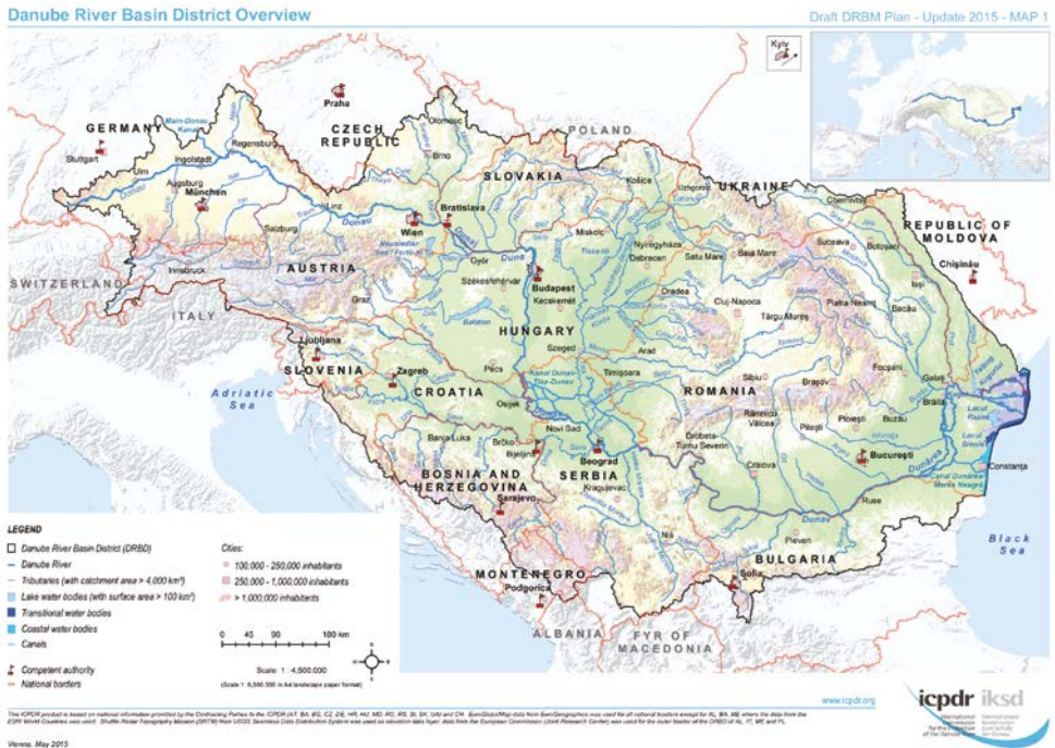
Figure 3. Danube River Basin