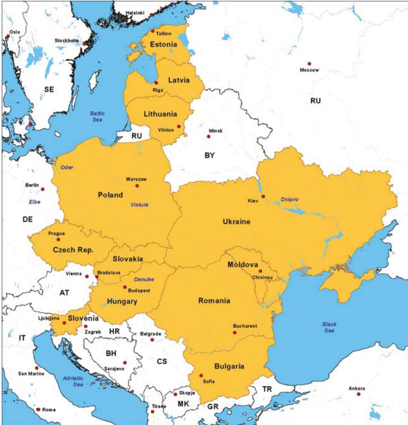
Figure 1. The countries of Central and Eastern Europe

Central and Eastern Europe covers a land area of 1.1 million km 2 and is mostly located in the Baltic Sea and Black Sea Basins (Figure 1).