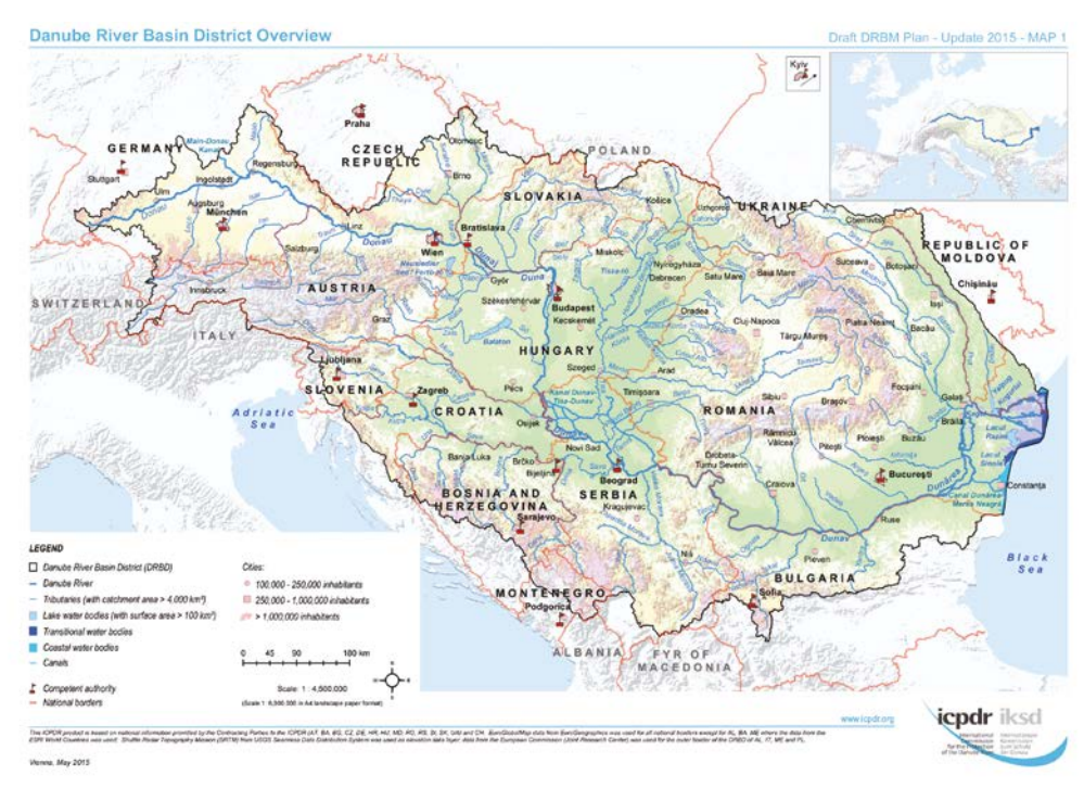
Figure 3. Danube River Basin