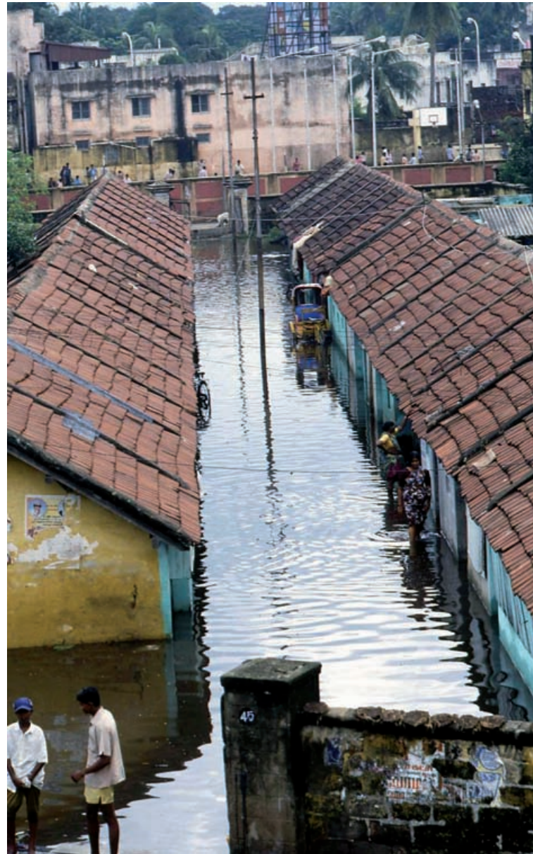
With most of Chennai, India being flat, floods can happen within six minutes from the start of a sustained burst of rain.