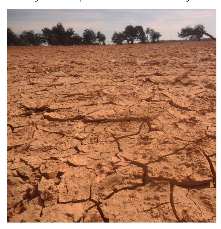
Workshop 4: Monitoring and moving forward

Participants will be introduced to existing and emerging sources of climate finance under the UNFCCC mechanisms as well as outside sources from development banks, the private sector and others. This stage will directly contribute to the NAPs and ensure medium to long term integration of adaptation into national development plans/programmes including medium expenditure frameworks and budgets.