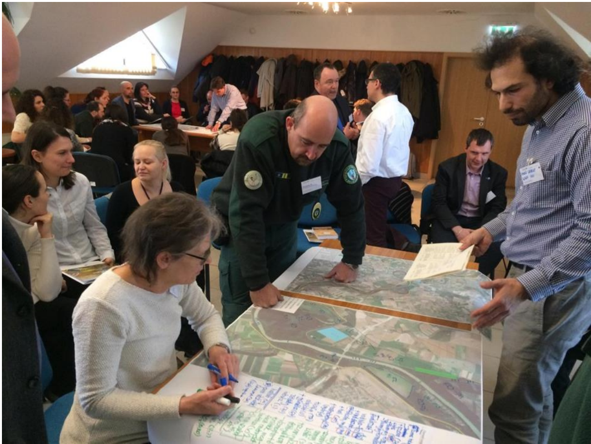
Stakeholders' forum of the Danube Floodplain Project in Szolnok

FramWat (Framework for improving water balance and nutrient mitigation by applying small water retention measures). FramWat aims to strengthen the regional common framework for floods, droughts and pollution mitigation by increasing the buffer capacity of the landscape. It will do so by using the natural (small) water retention measures (N(S)WRM) approach in a systematic way. So far, the majority of water management and flood protection measures lack innovation and follow more traditional approaches without taking into account valuable ecosystem services provided by nature in the landscape settings.