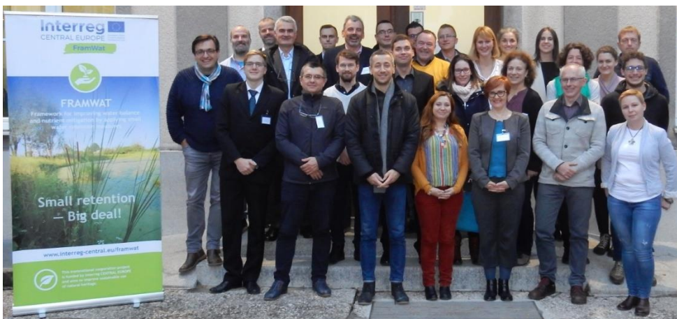
FramWat project meeting in Ljubljana

FramWat (Framework for improving water balance and nutrient mitigation by applying small water retention measures). FramWat aims to strengthen the regional common framework for floods, droughts and pollution mitigation by increasing the buffer capacity of the landscape. It will do so by using the natural (small) water retention measures (N(S)WRM) approach in a systematic way. So far, the majority of water management and flood protection measures lack innovation and follow more traditional approaches without taking into account valuable ecosystem services provided by nature in the landscape settings.