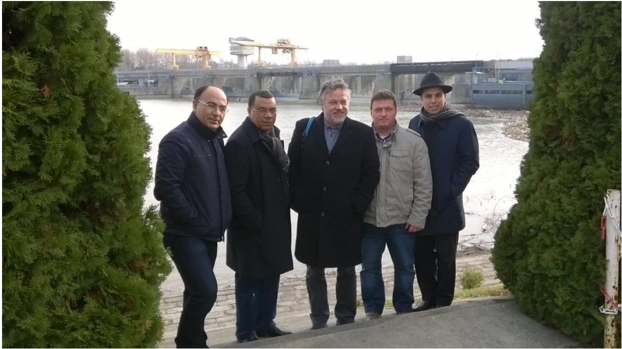
Visit of delegation of the Moroccan Water Authority