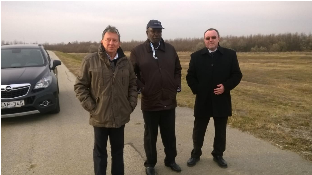
Member of the Nigerian Senate visited the operational area of KÖTIVIZIG