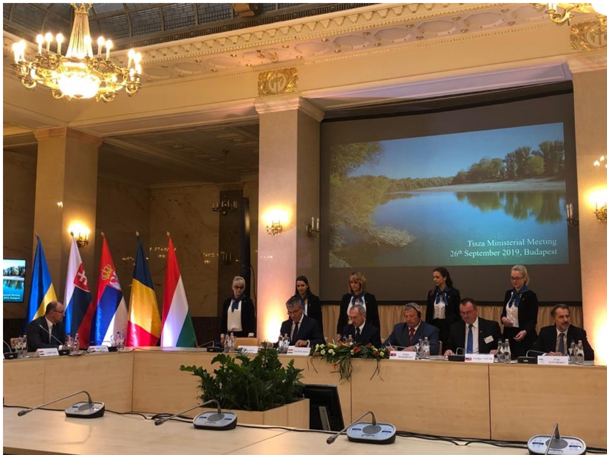
Signing of the Tisza Memorandum of Understanding (Tisza MoU) by representatives of the five Tisza countries in Budapest, September 2019

Finally, the main output of the project is the updated Integrated Tisza River Basin Management Plan and moreover the Tisza Memorandum of Understanding (Tisza MoU) signed by high level representatives of the concerned countries in September 2019 in Budapest.