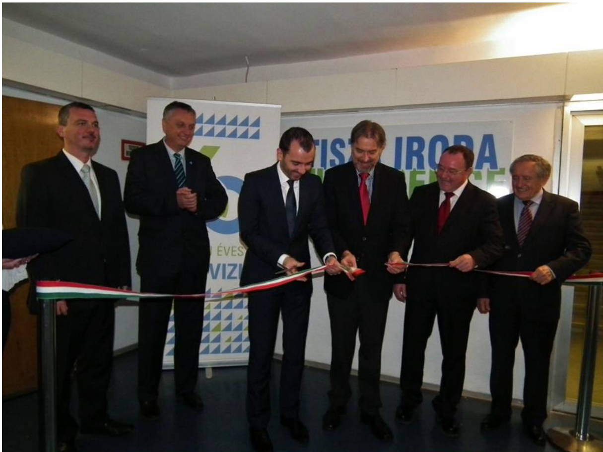
4th November 2014, Szolnok Official opening of the Tisza Office

The main task of the Tisza Office is the coordination of Tisza issues at national level in partnership with the ICPDR, the Secretariat of the Danube Region Strategy Ministerial Commissioner of the Ministry of Foreign Affairs and Trade, the River Basin Management and Water Protection Department of the Ministry of Interior, the General Directorate of Water Management, different departments of KÖTIVIZIG and with other Hungarian and foreign partners.