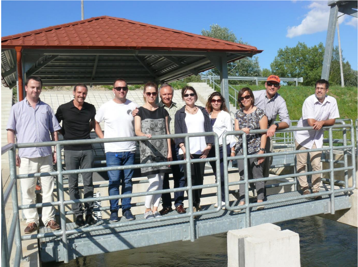
Visit of US experts' and staff of the US Embassy of Budapest in Kisköre