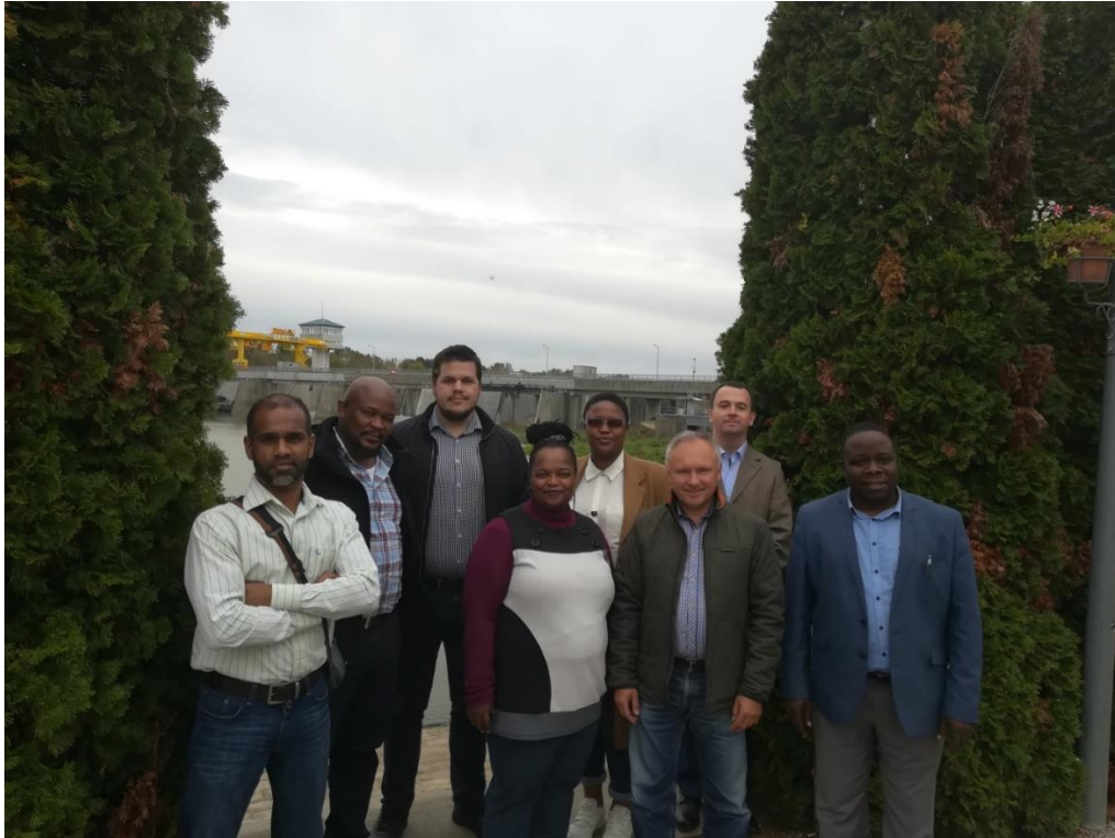
Experts' delegation from South Africa visited the Kisköre Dam