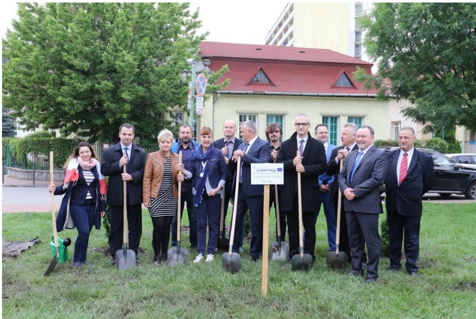
Tisza tree ( Taxus baccata ) planting in 'JOINTISZA Grove' of Szolnok

As a flagship project, the main aim of JOINTISZA (2017-2019) was to improve the status of waters of the Tisza River Basin. It focused on the interactions of two key aspects of water management — river basin management (RBM) and flood protection — while taking into account the relevant stakeholders who play a pivotal role in the Tisza RBM planning process. The vproject contributed to enhance the integration of water management and flood risk prevention planning and actions for the next River Basin Management planning cycle, in line with the relevant EU legislation. The project involved the joint efforts of five countries of the Tisza Basin (Hungary, Romania, Serbia, Slovakia and Ukraine) and international institutions as the International Commission for the Protection of the Danube River (ICPDR).