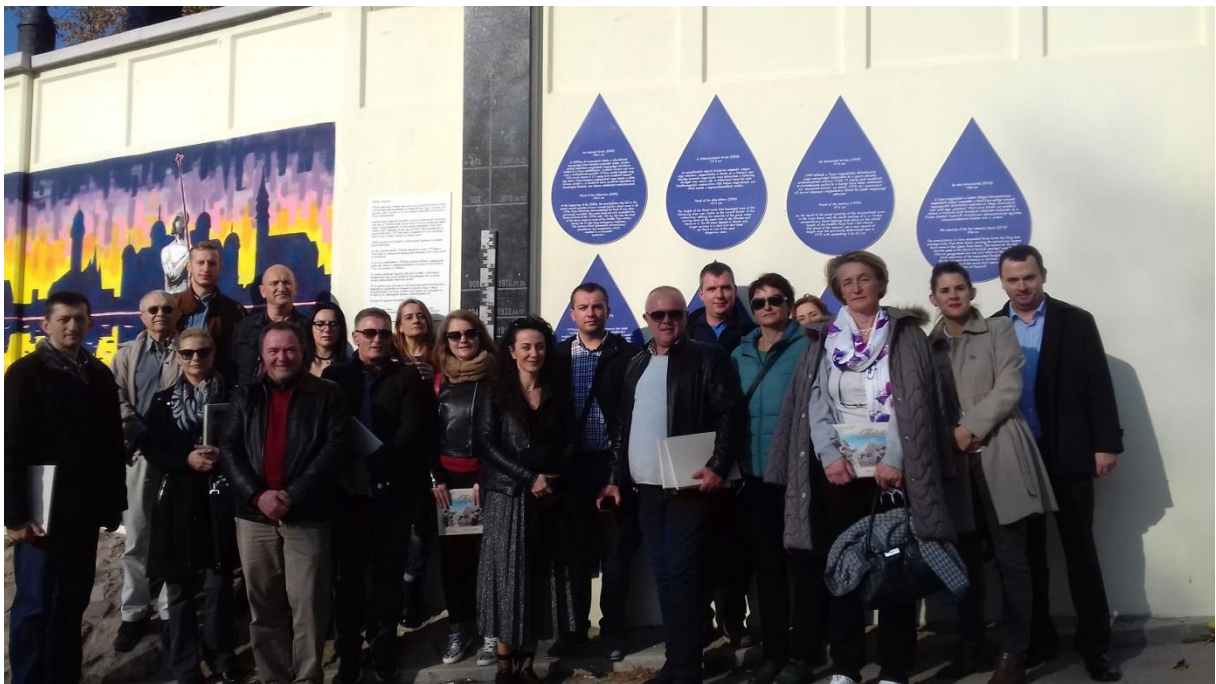
Visit of a Serbian delegation in Szolnok co-organized by Mashav (Israel's Agency for International Development Cooperation)