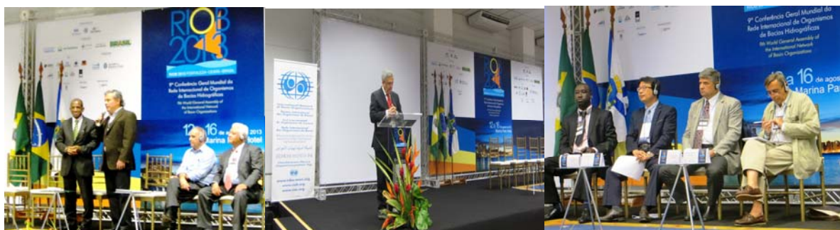
Welcome from the former and new INBO Presidents