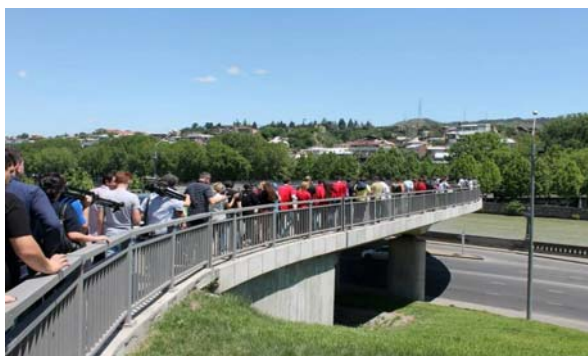
Demonstration in Tbilisi