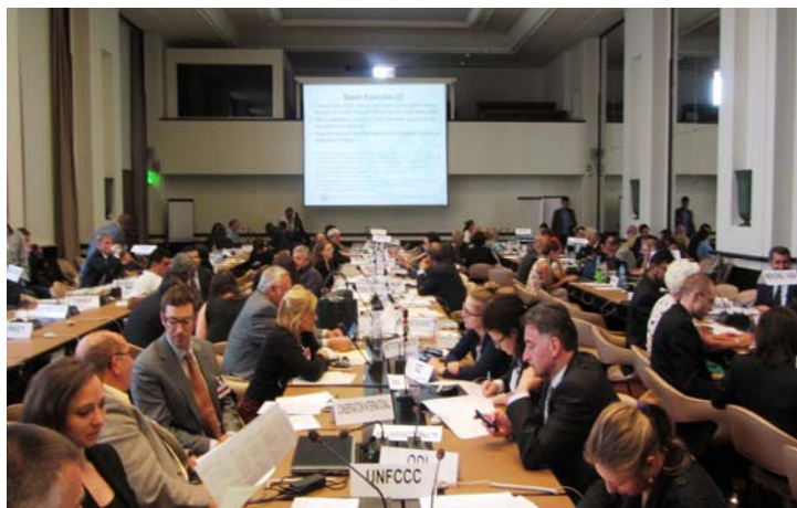
Working moments of the UNECE 4 th Seminar on Water Resources and Adaptation to Climate Change in Transboundary Basins, 25-26 June 2013, Geneva

Application for the organization of Special Focused Event by GWP CACENA was approved.