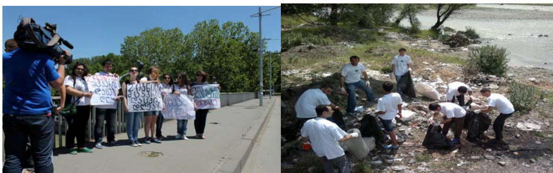
"Cleaning actions" in Tbilisi and Akhaltsikhe