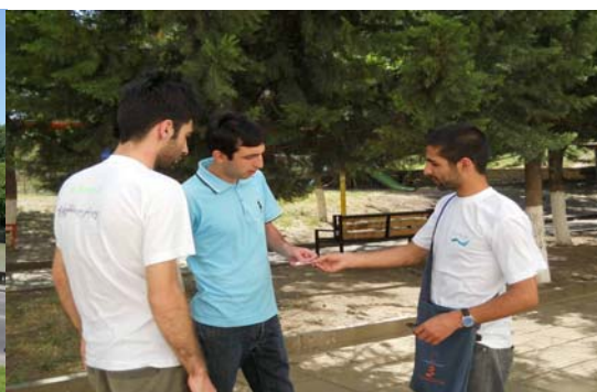
Disseminating the calendars

1.1.2 In Azerbaijan the Kura-Araks Day was celebrated on 5 June simultaneously with the Day of Irrigator in Baku and some regions. These events were broadly reported in mass-media. CWP-Azerbaijan issued the booklet "2 June - the Kura-Araks rivers day", which was disseminated among participants.