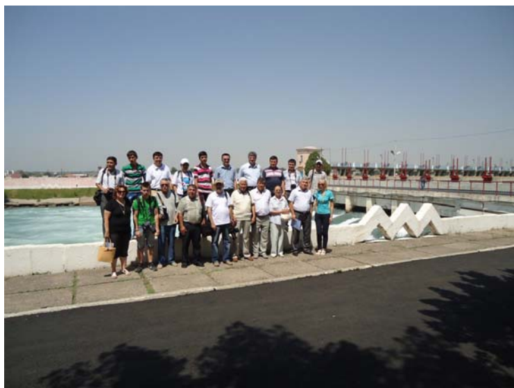
Participants of the media-tour