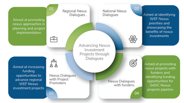
Figure 3. Nexus Investments projects through dialogues

The activities include organizing national and regional Nexus dialogues. The WEF Nexus regional and country dialogues will provide platforms to bring together stakeholders from the three sectors and establish a common mechanism for coordination between the three sectors.