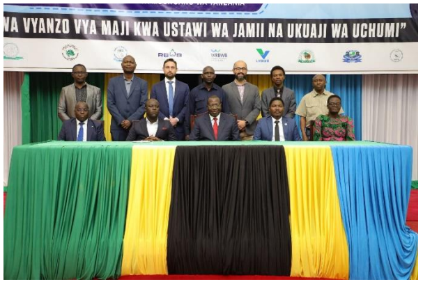
Figure 5 Presentation of preliminary results of the Stage 3 study in the 8th General Meeting of the Basin Boards, Tanzania, November 2022

In Tanzania, the Ministry of Water engaged the SP to answer the simple question: how much does water contribute to Tanzania's economy? The reason for the question was that there was a perceived mismatch between the importance of the topic and the current budget allocations for water, but it was unknown how much would be the right budgetary allocation to match the importance of water. The SP, with the Ministry of Water, thus initiated an analysis based on available data about water use and derived economic benefits