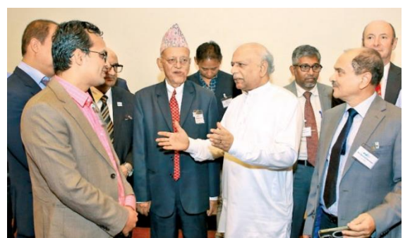
Figure 3 The Sri Lankan Prime Minister in meeting with the GWP South Asia Steering Committee, November 2022

Regional Report – Progress on IWRM in the South Asia Region: In collaboration with the South Asia Co-operative Environment Programme (SACEP), the SP produced a report on the status, challenges and recommendations on IWRM implementation in South Asia, based on the results of the 2020 monitoring on SDG 6.5.1 which will be launched in early 2023. The report highlights how IWRM can support advancing climate-resilient development in the region.