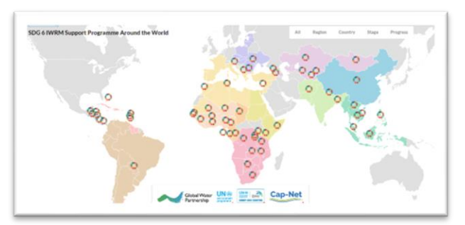
Figure 7 View of the Results Map

The <u>IWRM Action Plan Searcher</u> and <u>Results Map</u> were launched in 2021, as a central repository of the actions defined by countries assisted by the SP. The Action Plans Searcher's aim is to present actions from IWRM Action Plans to potential investors and supporters, while raising transparency and accountability from countries, and ensuring the standardisation of actions