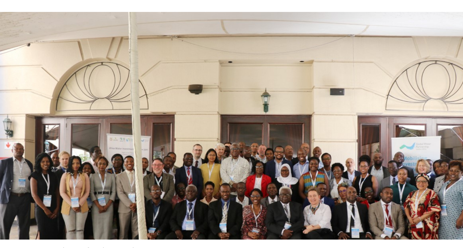
Group photo of 13th Consulting Partners' Meeting

The GWPSA 13th bi-annual Consulting Partners meeting was held on the 4th and 5th of November 2019 in Pretoria, South Africa under the theme Mobilising Investments for a Water Secure Southern Africa Region .