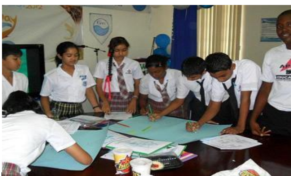
Students creating water conservation posters for World Water Day.

Here's a look at some of the activities that took place during the WWD Symposium: