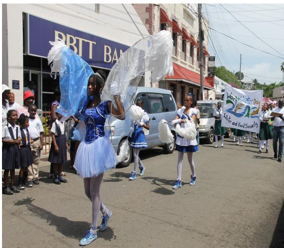
St. Joseph's Convent - Winner of the top prize at the NAWASA's 2 nd Annual Water Conservation March.

At the cultural event, students of all ages engaged in water conservation activities and were encouraged to use innovative ways to conserve water. Prizes were awarded to the best organised school; the best banner; the best placard; and the best march past portrayal at the primary and secondary school level.