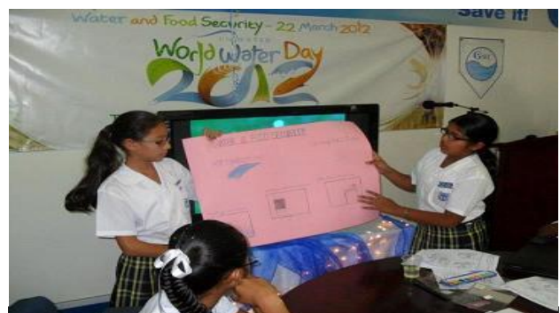
Students are seen here presenting their water conservation posters.