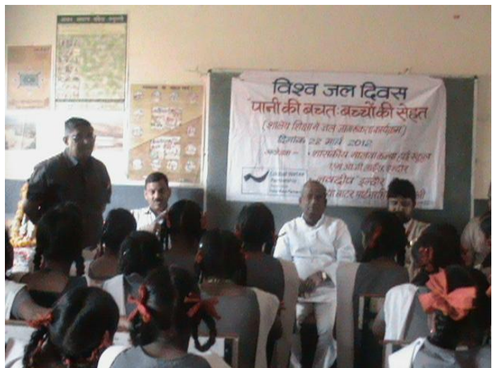
Celebration of World Water Day at Indore, Madhya Pradesh

India Water Partnership (GWP India) Central Zonal Water Partnership Coordinating Agency Navdeep, organized World Water Day 2012, in Indore city, Madhya Pradesh, to integrate school education with water saving, health, hygiene and sanitation awareness. The programme which was first of its kind, has not only generated thinking among school children on water conservation, hygiene and sanitation but also motivated school teachers to provide information to students as to how habits of using safe water can be improved among children living in Slum areas.