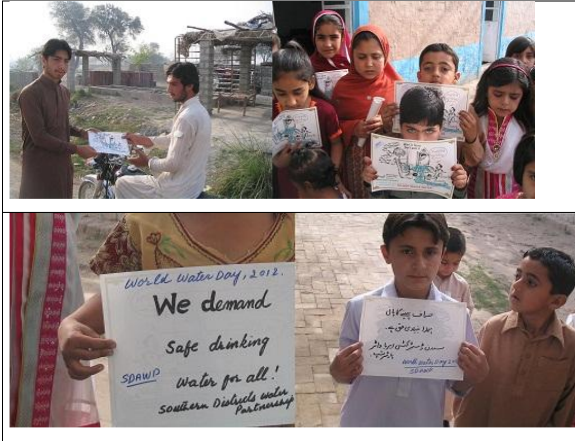
4.2 Bolan and Sarawan AWP's celebrated World Water Day in Quetta and Mastung on 22 March 2012 and displayed awareness banners at prominent places in both cities. Awareness material was distributed among general public and school students.