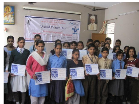
School children of BDS School, Meerut receiving Certificates for their participation in the Inter-school poster competition