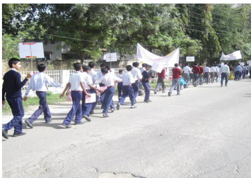
Water walk by school children at Meerut