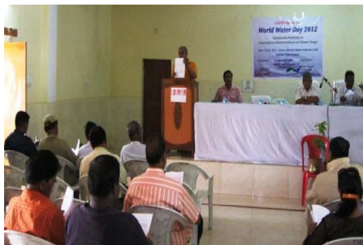
World Water Day celebration at Kholan G.P Head Quarter of Kholan of Titlagada block, Bolangir district (Orissa)