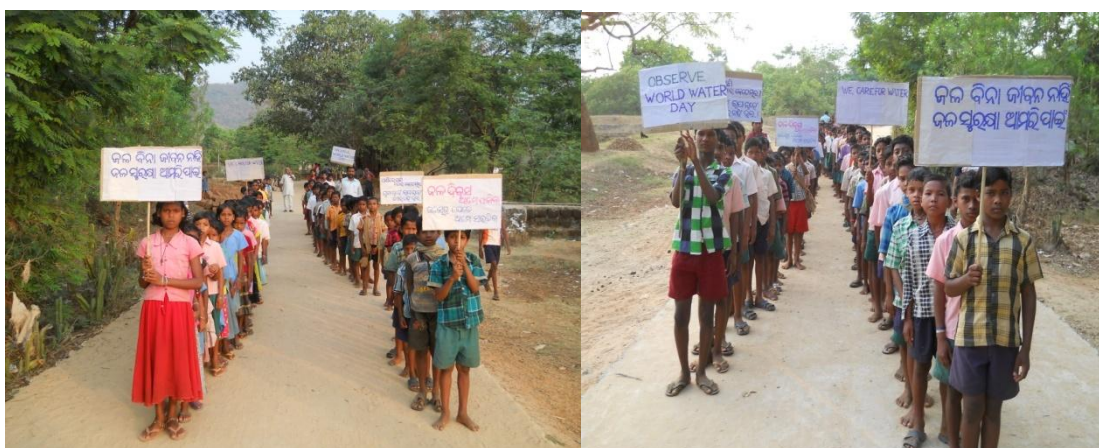
Rally by School children on World Water Day at Kadua and Bhagirathipur villages of Dhenkanal district, Orissa

GWP-India organized the World Water Day or Vishwa Jala Divas with the support of partner NGO; Arun Institute of Rural Affairs, Dhenkanal District, Orissa and the participation of school children from Kadua and Bhagirathipur villages of Dhenkanal district, Orissa. More than 250 students both boys & girls marched the village streets with placards bearing slogans 'save water', 'save our planet' in their attempt to educate and improve awareness among the community members.