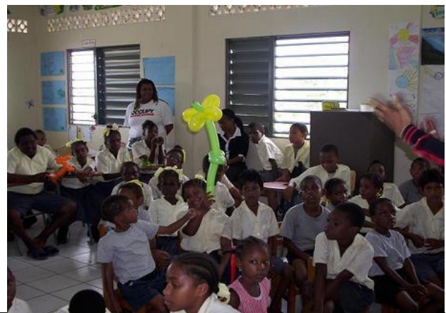
Students are seen here during the interactive "Gender, Climate Change and Water" workshop put on by the Women, Gender and Water Network on March 23 rd , 2012.

Also in Trinidad, the National Institute of Higher Education Research, Science and Technology (NIHERST) visited primary and secondary schools in rural areas on WWD to share information on water conservation. The school visits were within the framework of a NIHERST project aimed at establishing rainwater harvesting systems for more than ten primary and secondary schools in rural areas in Trinidad.