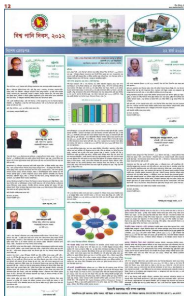
Special news paper supplement published on World Water Day (cosponsor BWP)

This year the Government of Bangladesh celebrated the World Water Day in all the 64 administrative districts of the country. Previously the celebration had been limited to few large cities. For the first time BWP acted as a cosponsor of this country wide mega event.