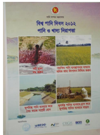
Posters brought out on World Water Day and distributed throughout the country by the GoB (cosponsor BWP)