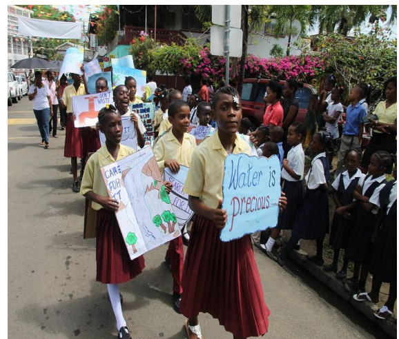
Students displaying their placards with water conservations messages.