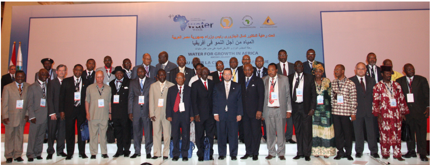
At least 33 Ministers and their representatives witnessed the launch at Africa Water Week 2012.

Photo on front page: Honorable S.S. Nkomo, Vice President of the African Ministers' Council on Water, and Minister of Water Resources and Development, Zimbabwe and GWP Executive Secretary Dr Ania Grobicki.