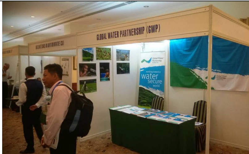
Booth of GWP at the MRC Conference