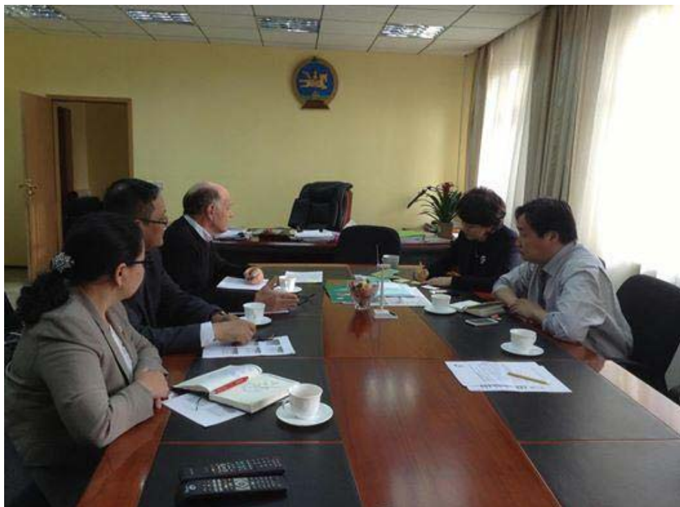
The WRG representative and the State secretary of MGDE