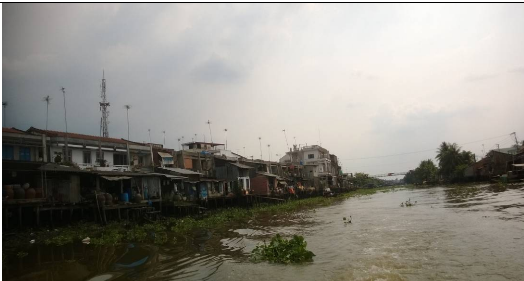
Somewhere in the Mekong River delta (2)