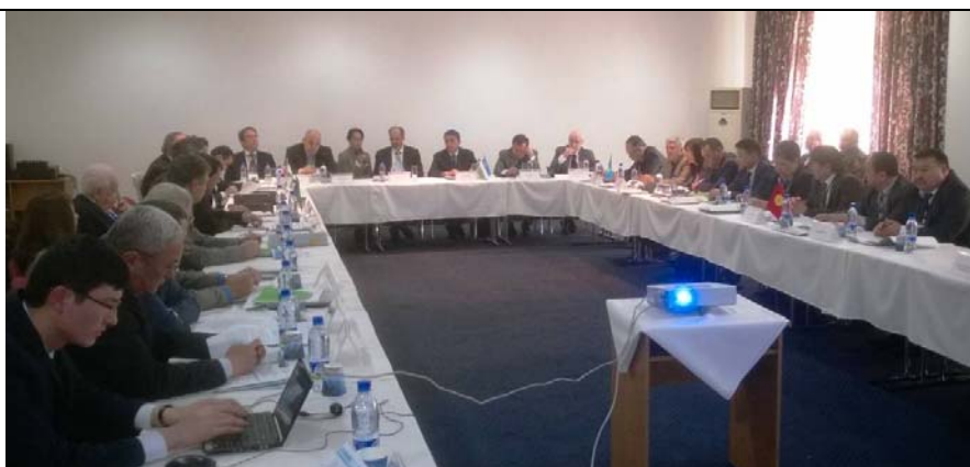
Working moment during Workshop on 19 April

ICWC delivered special request to GWP CACENA together with other international agencies to support the sub-regional Central Asia preparatory process towards the 7 th World Water Forum. That is the recognition of the real political weight of GWP CACENA among water leaders of the Central Asian countries.