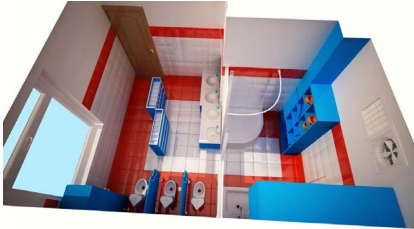
Redesigned child friendly sanitation room for kindergarten n 22

Taking consultation to develop a Guideline "Child friendly sanitation in public kindergartens in Ulaanbaatar" supported by the Japanese fund of Children.