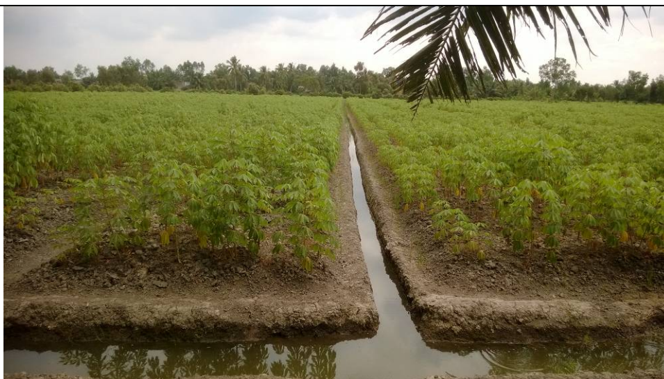
Farmer's field with Cassava (Tapioca) - which is the third largest source of food carbohydrates in Vietnam, after rice and maize