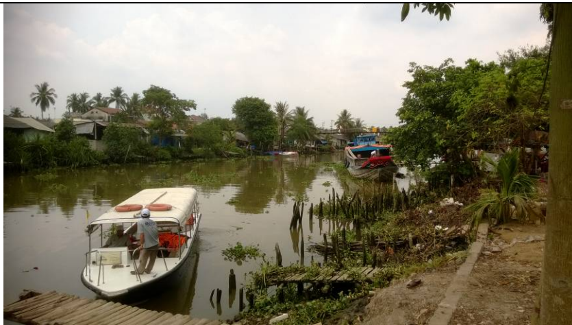
Somewhere in the Mekong River delta