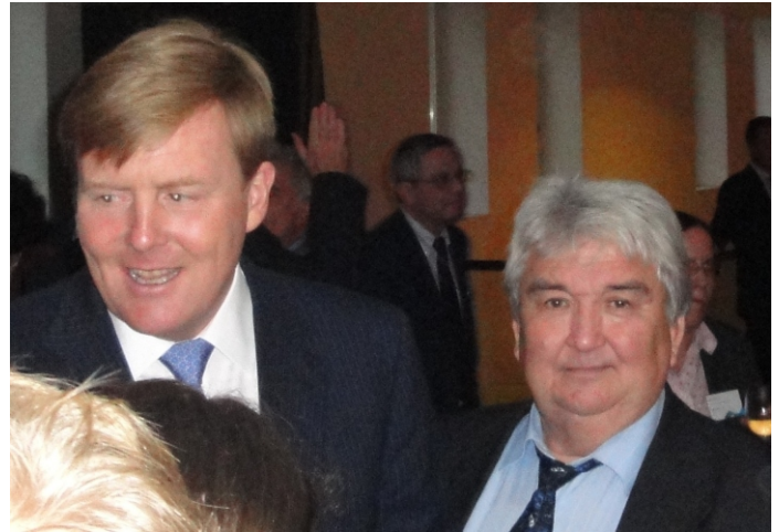
The future King: "Now I am sure for the future of The Netherlands!"