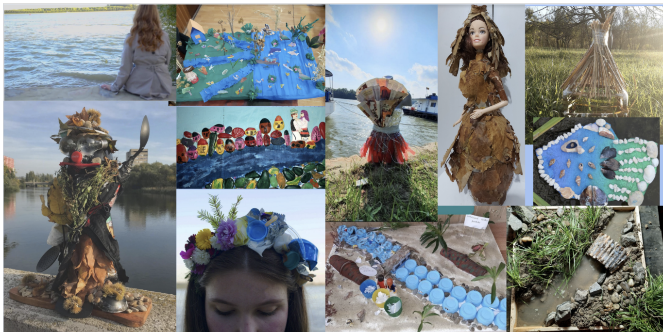
Imagini 2: the 11 papers selected to participate in the international 2020 DAM

Below the video are some of the winning works https://youtu.be/U1mqzxuSh-U