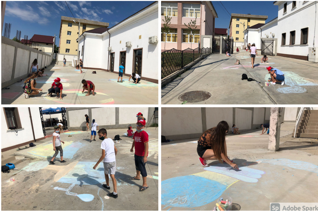
Imagine 5. Participants at the event