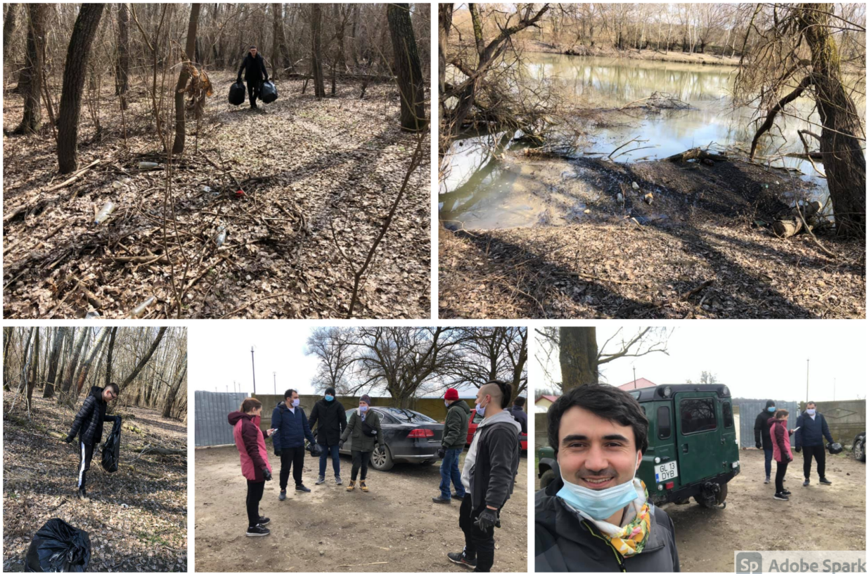
Imagine 3. Collecting plastic waste off the banks of Prut River

2. Participation in the greening action organized by the Pro Natura Galați Association in collaboration with the “More Green Association” you can access a video at the following link: https://fb.watch/4PQE2rKjAe/