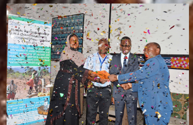
GWPEA launches the Global Water Leadership Program in a Changing Climate Program (GWL) in Uganda Pg 9