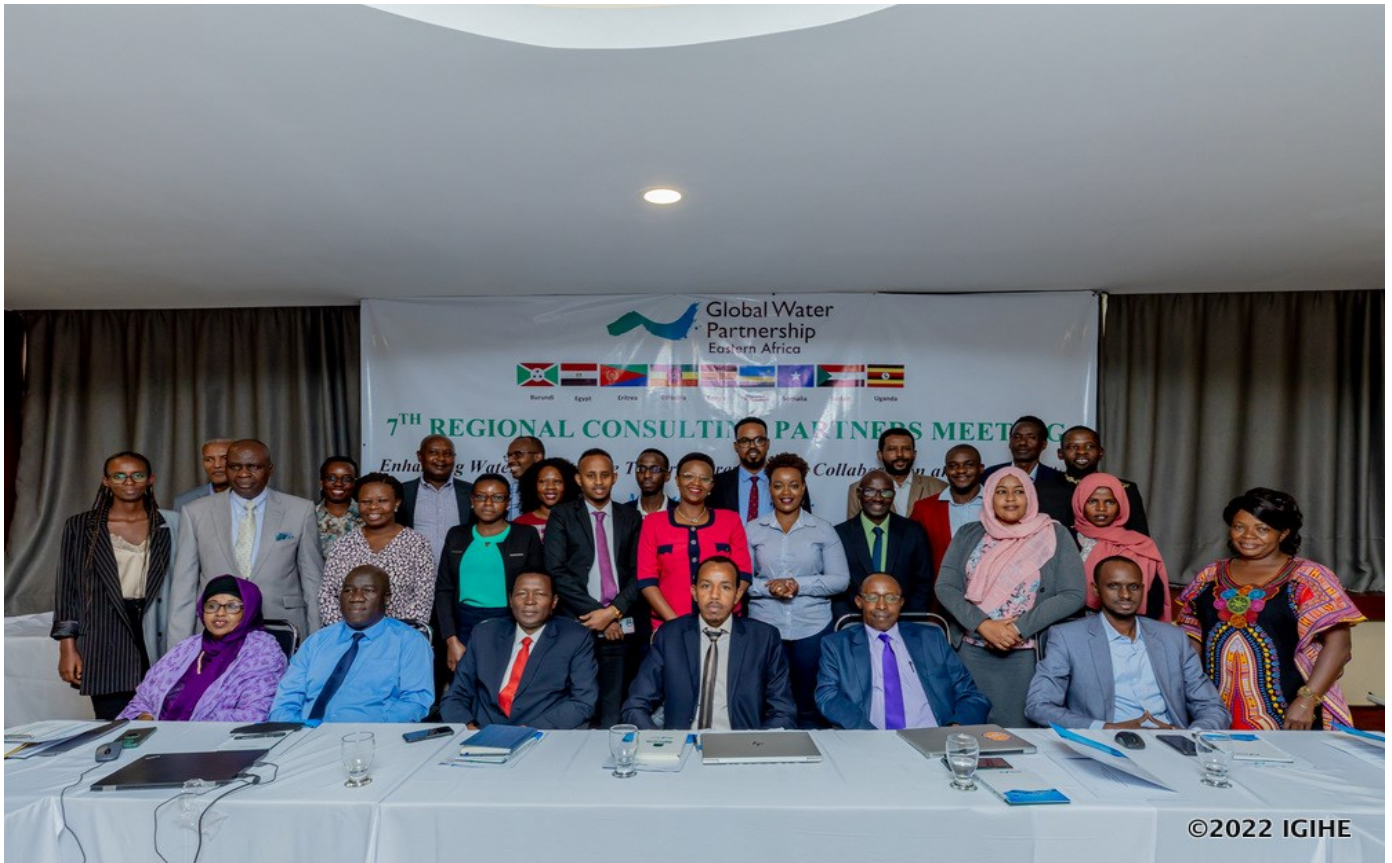
Global Water Partnership- Eastern Africa held its 7th Regional Consulting Partners (RCP) meeting on 17th to 18th June 2022, at M-Hotel, Kigali in Rwanda.