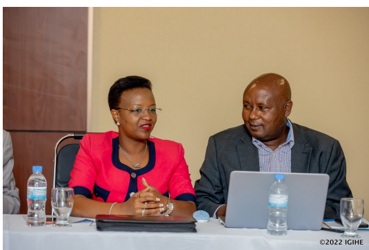
Some of the Consulting Partnership Members attending the meeting

processes. The meeting convened to chart a clear direction for GWPEA hosting arrangements, discuss modalities of strengthening the Country Water Partnerships and their financing as well as review the amendments to the GWPEA constitution.