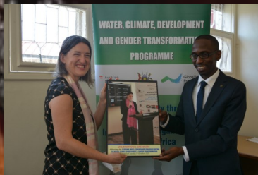
Austrian Embassy Development Cooperation in Uganda mission visits GWPEA P5