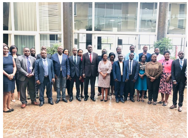
Members of UWP with the Parment Secretary of the Ministry of Water during the breakfast meeting and private sector actors

Uganda Water Partnership partnered with Ministry of Water and Environment and GWPEA to convene a breakfast meeting with the aim of making innovative finance work for sustainable development. The purpose of the meeting was to engage and attract the private sector players to develop appropriate and effective packages that cater for increased investment and financing in water and climate resilience that are inclusive and promote gender transformation. The meeting also discussed innovative financing instruments for gender transformation in water including use of Private and Public Partnerships, blended finance instruments as well as developing strategies to foster inclusion of private sector stakeholders in these processes.