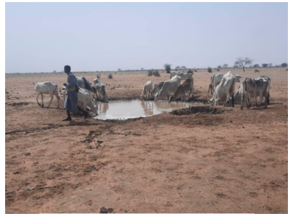
An example of a Haffier in Sudan

activities will have to be revised to suit and solve challenges most affecting the communities.