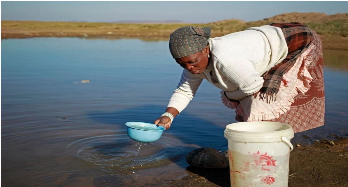
A woman fetches water for home use in Lake Victoria