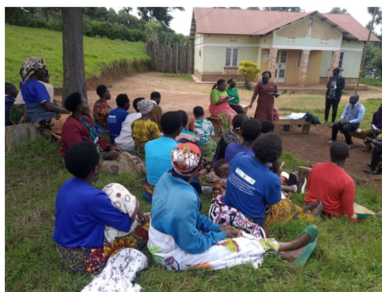
Women artisans of the Mukirwa women Group in Kigezi undergoing a training

Gender Action Plan for Maziba Catchment. The stakeholders included local government technical and political officials, CSOs, Academia, Media, and Private Sector. One of the key recommendations that was adopted was to review Maziba Catchment management plan to integrate gender transformative approaches and mindset change towards gender norms and beliefs that are barriers to the achievement of gender transformation.