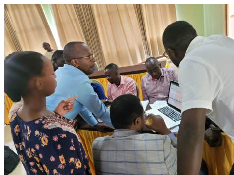
Participants of one of the Thematic Working Group developed under GWL

Four working groups were established to continue engaging in further project steps in this regard. This was based primarily on the identified bottlenecks and how relevant these are to the expertise of present participants. Since the next step after the identification of