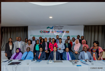
Global Water Partnership- Eastern Africa holds 7th Regional Consulting Partners (RCP) meeting