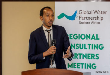
GWPEA appoints New Chair for the CP and RSC