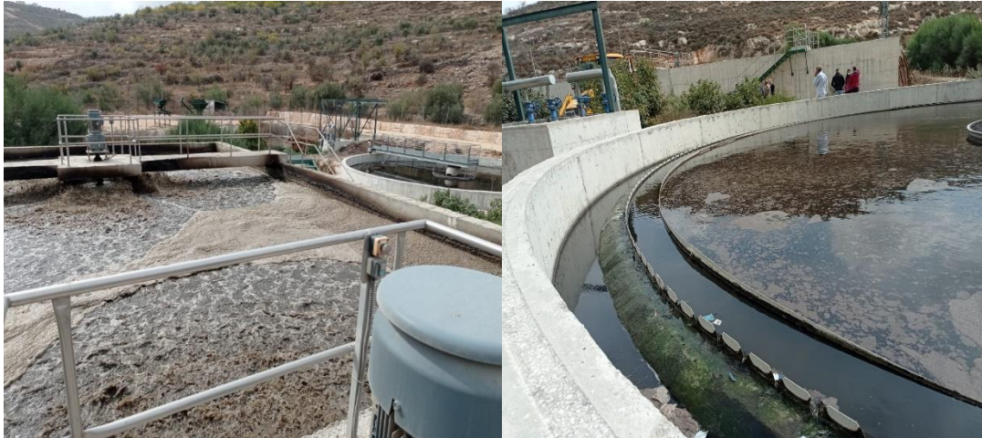
Al-Arroub Plant wastewater treatment at Sier, Hebron / Palestine

The quality of the influent and effluent of Al-Arroub WWTP as well as the recommended guidelines for the application of treated wastewater by the Palestinian Standards Institute are presented in the tables below.