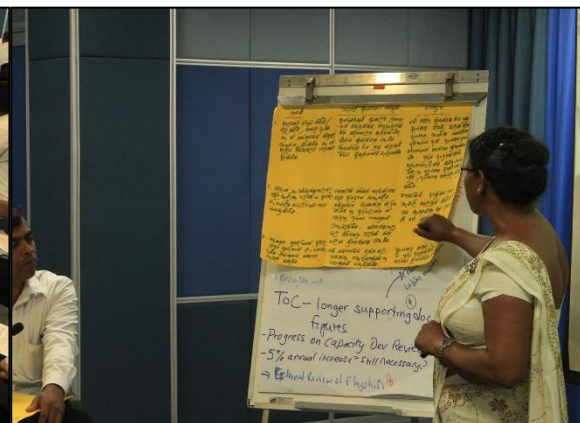
A presentation conducted by a participant