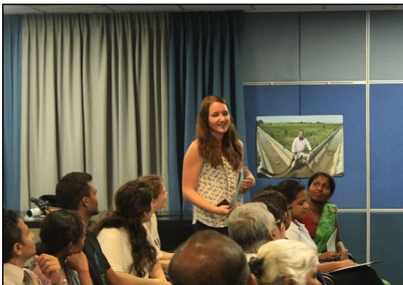
A student from France